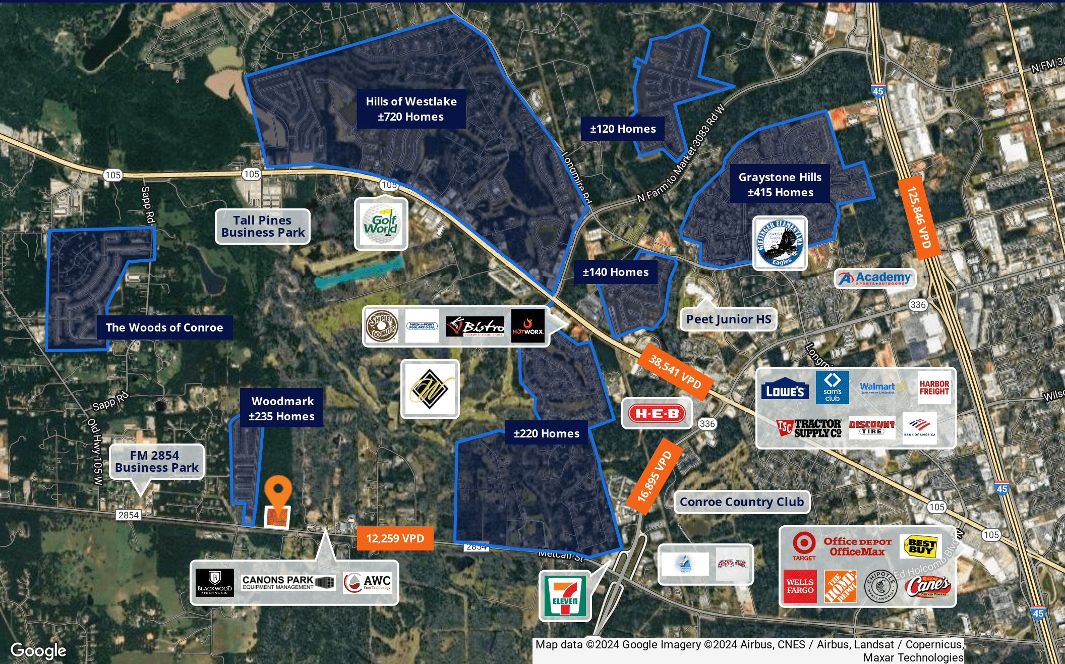
Map data ©2024 Google Imagery ©2024 Airbus, CNES / Airbus, Landsat / Copernicus, Maxar Technologies