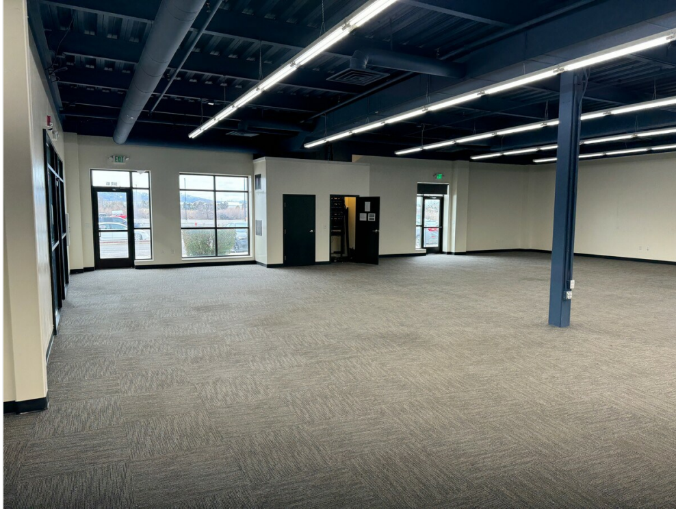
Open floor space