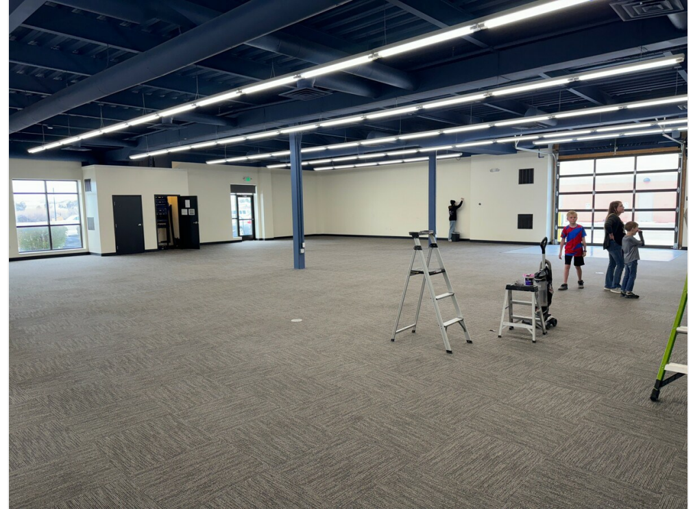
Glass overhead door