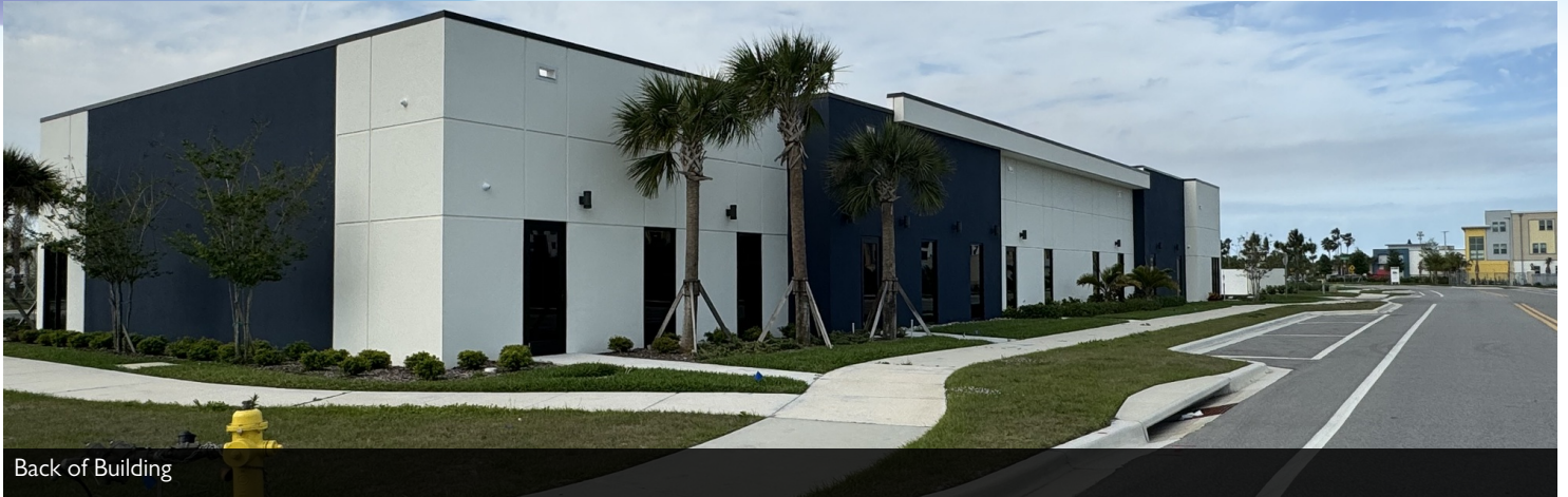
Back of Building

Professional Office Space at Addison Center At Viera • Vidina Drive / Ivanhoe Drive / Stadium Parkway Melbourne, FL 32940