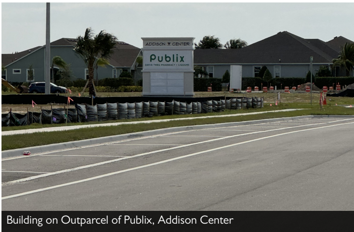
Building on Outparcel of Publix, Addison Center