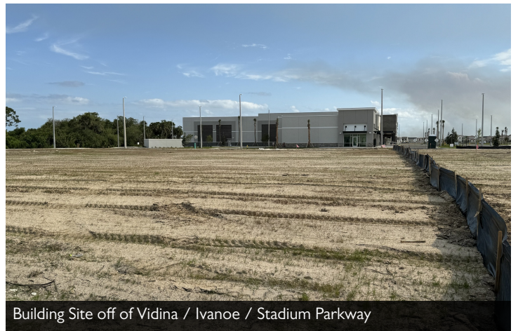
Building Site off of Vidina / Ivanoe / Stadium Parkway