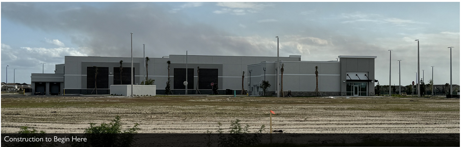
Construction to Begin Here