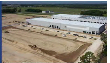
Build to Suit