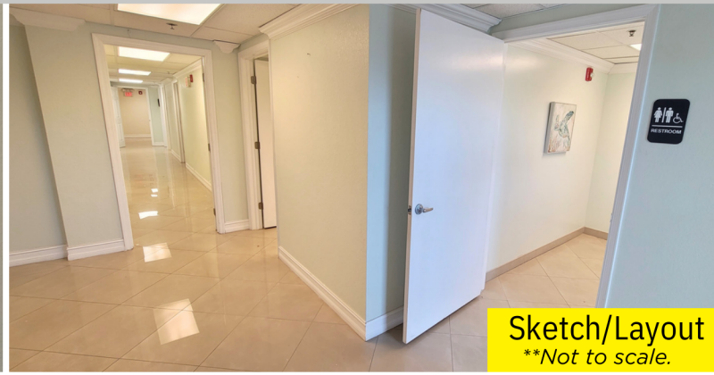
Sketch/Layout **Not to scale.