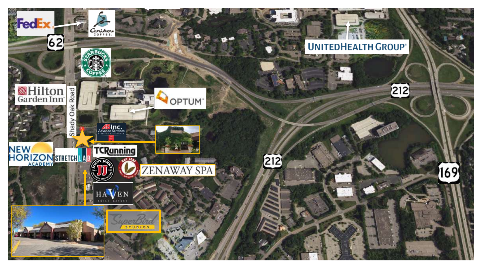
This information is accurate as of the date of printing and is subject to change without notice. All information is deemed accurate, but cannot be guaranteed.