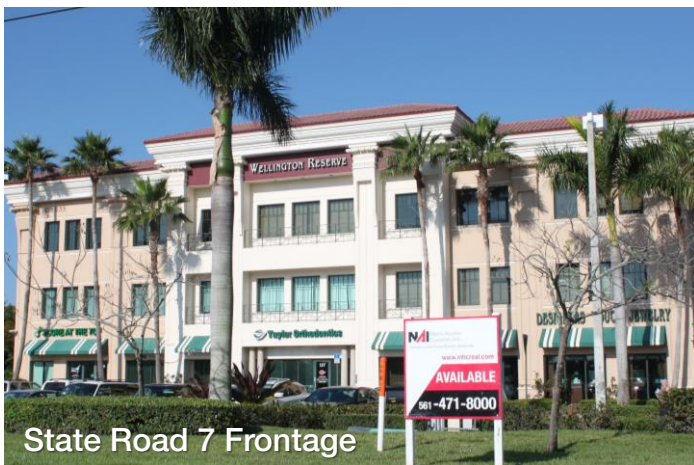
State Road 7 Frontage

Fantastic Location in the Center of Wellington's Retail Corridor