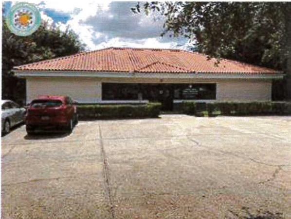
1202 E SILVER STAR RD, OCOEE, FL 34761 9/8/2020 1:22 PM