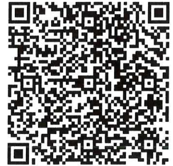
QR Code For Mobile Phone