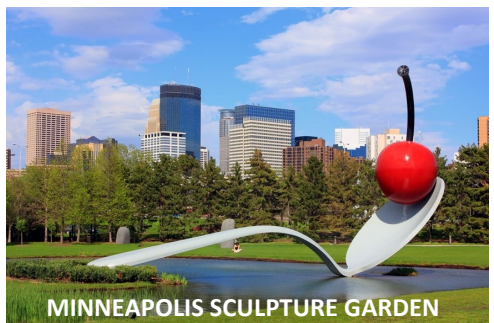
MINNEAPOLIS SCULPTURE GARDEN

THIS INFORMATION HAS BEEN SECURED FROM SOURCES WE BELIEVE TO BE RELIABLE, BUT WE MAKE NO REPRESENTATIONS OR WARRANTIES, EXPRESSED OR IMPLIED, AS TO THE ACCURACY OF THE INFORMATION. REFERENCES TO SQUARE FOOTAGE OR AGE ARE APPROXIMATE. UPLAND HAS NOT REVIEWED OR VERIFIED THIS INFORMATION. BUYER MUST VERIFY THE INFORMATION AND BEARS ALL RISK FOR ANY INACCURACIES.