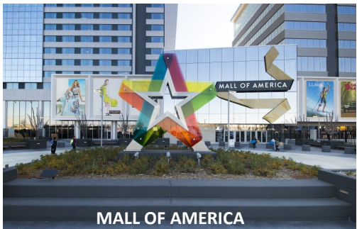
MALL OF AMERICA