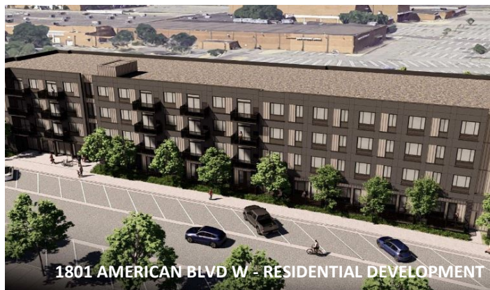
1801 AMERICAN BLVD W - RESIDENTIAL DEVELOPMENT