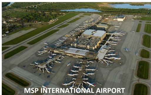
MSP INTERNATIONAL AIRPORT