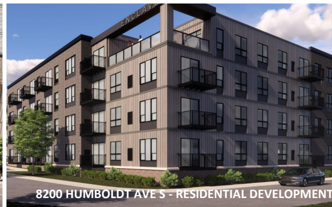
8200 HUMBOLDT AVE S - RESIDENTIAL DEVELOPMENT

THIS INFORMATION HAS BEEN SECURED FROM SOURCES WE BELIEVE TO BE RELIABLE, BUT WE MAKE NO REPRESENTATIONS OR WARRANTIES, EXPRESSED OR IMPLIED, AS TO THE ACCURACY OF THE INFORMATION. REFERENCES TO SQUARE FOOTAGE OR AGE ARE APPROXIMATE. UPLAND HAS NOT REVIEWED OR VERIFIED THIS INFORMATION. BUYER MUST VERIFY THE INFORMATION AND BEARS ALL RISK FOR ANY INACCURACIES.