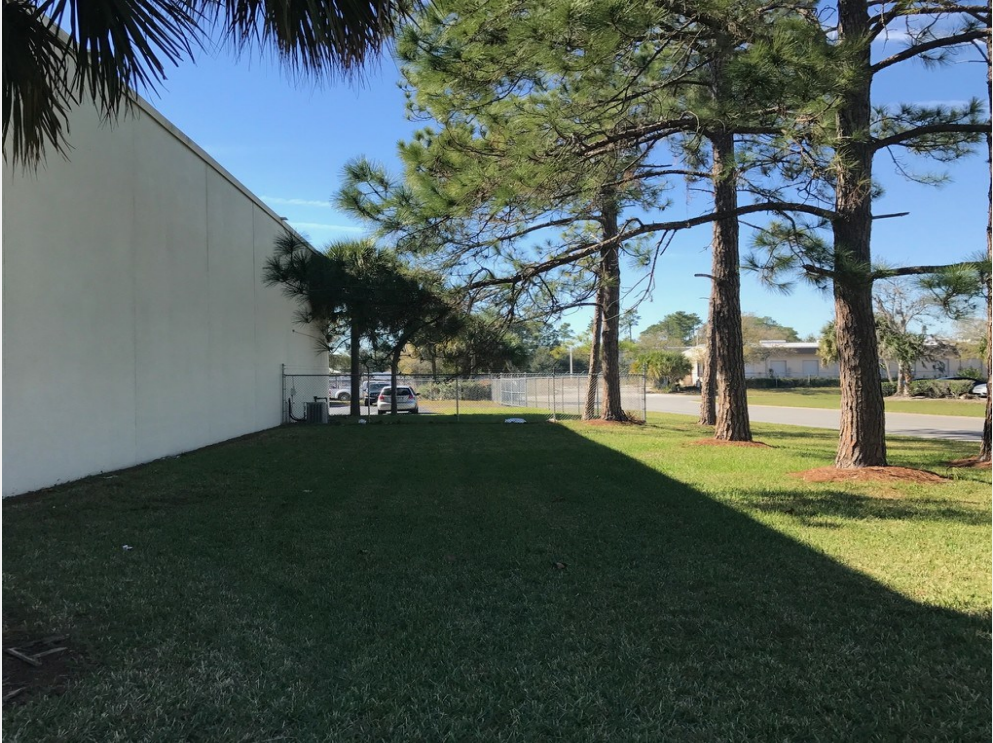
Gary Gagnon Building Photo