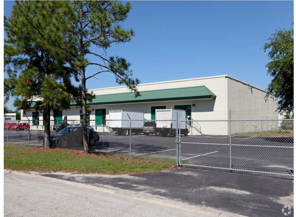
Gary Gagnon Building Photo