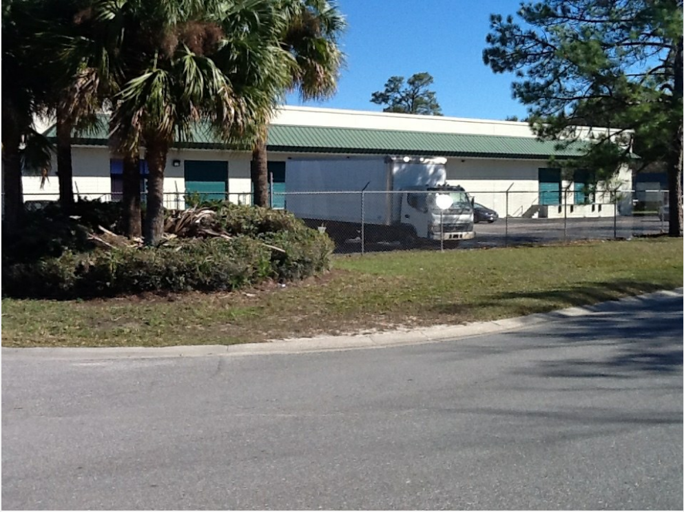
Rob Dolan Building Photo