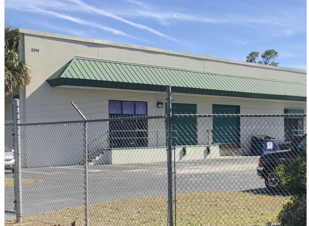
Gary Gagnon Building Photo