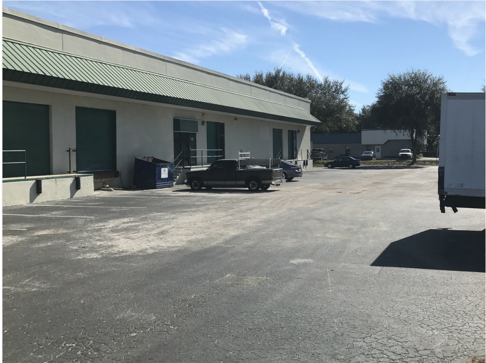
Rob Dolan Building Photo