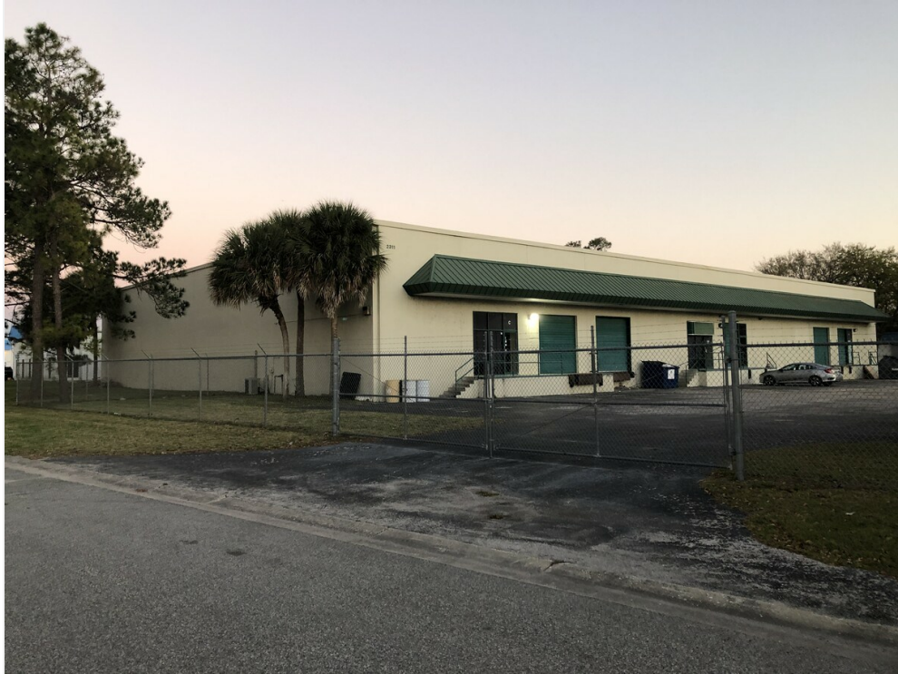
Gary GagnonMercator Front Side Entry