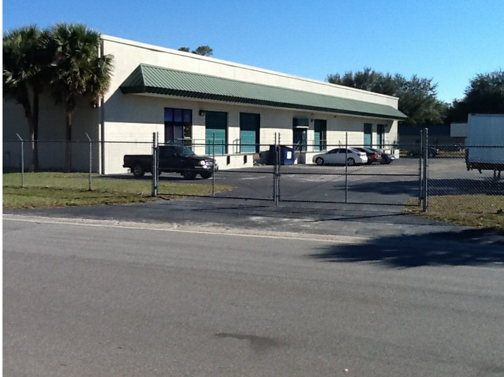
Rob Dolan Building Photo