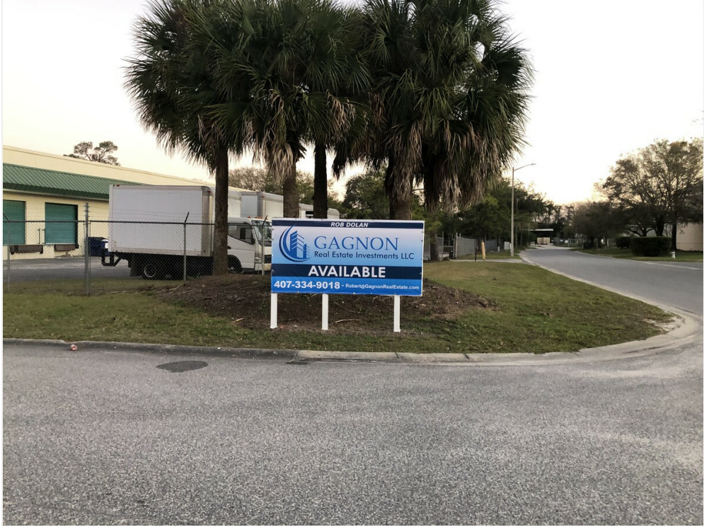
Mercator front w sign