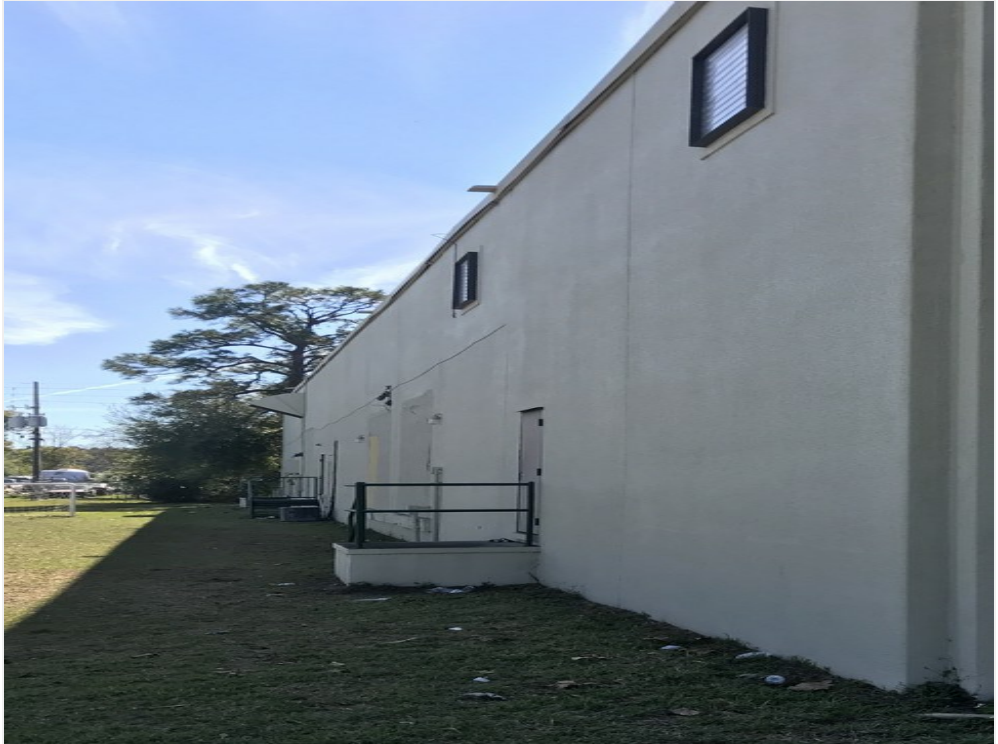
Gary Gagnon Building Photo