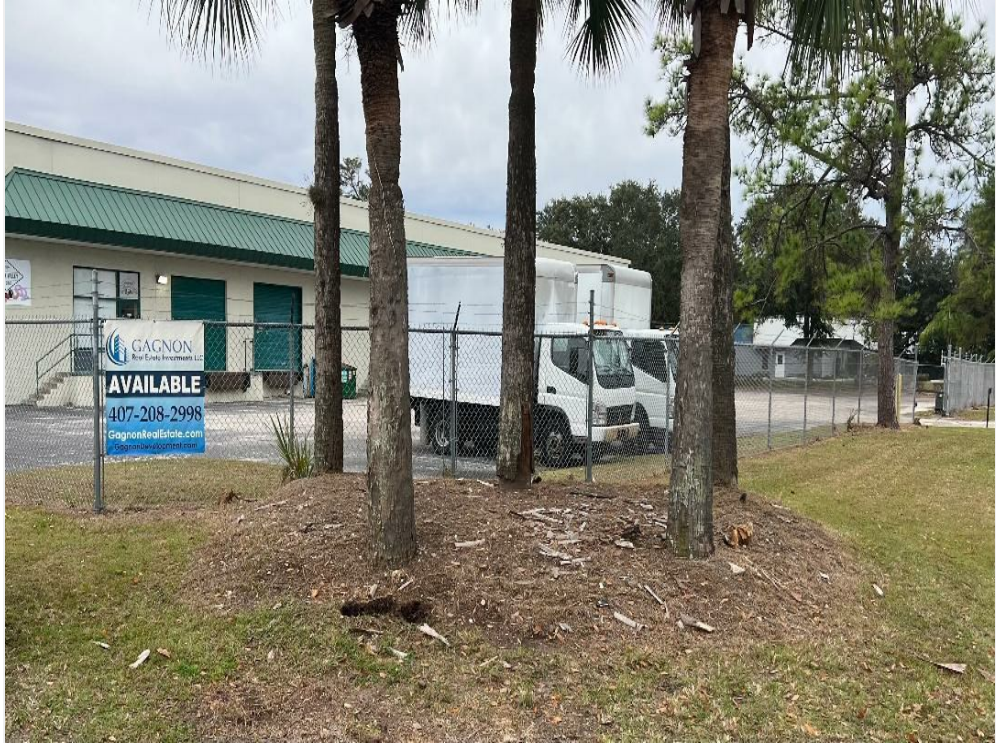
small temp sign Gary Gagnon