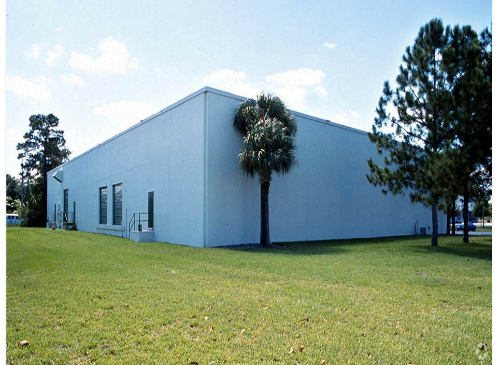
Rob Dolan Alternate building view