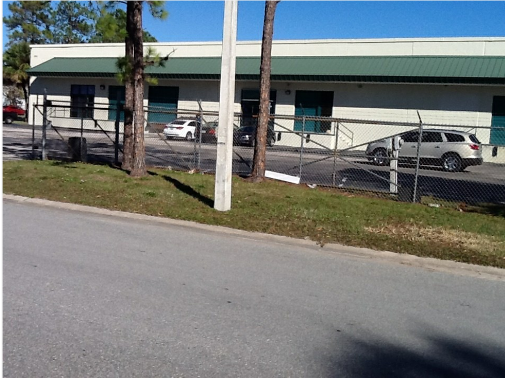
Rob Dolan Building Photo