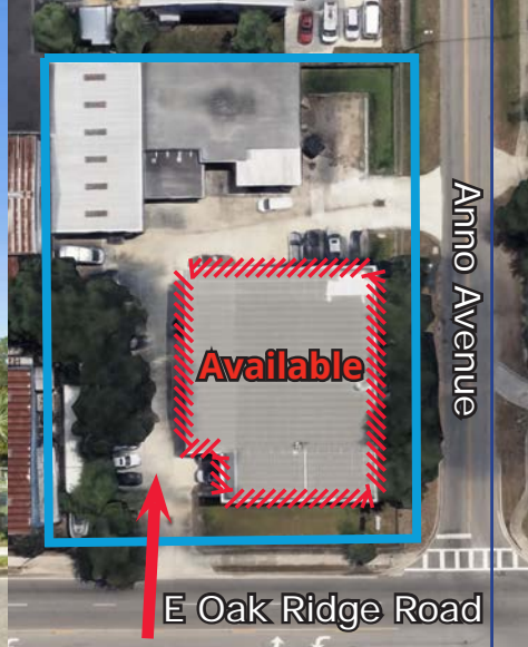
E Oak Ridge Road