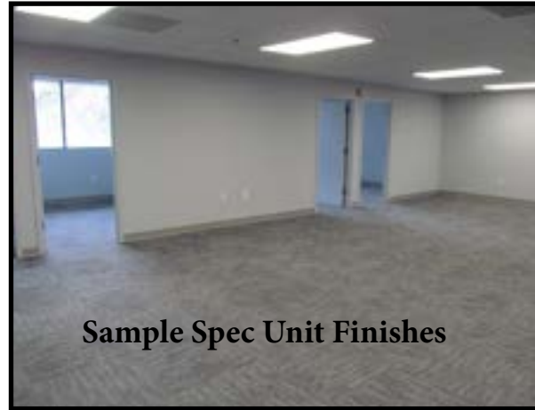
Sample Spec Unit Finishes