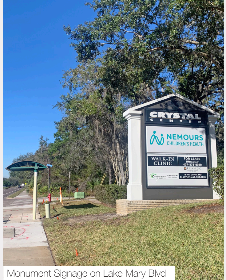
Monument Signage on Lake Mary Blvd