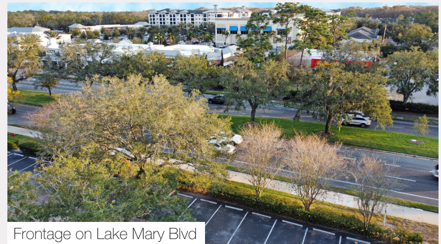
Frontage on Lake Mary Blvd