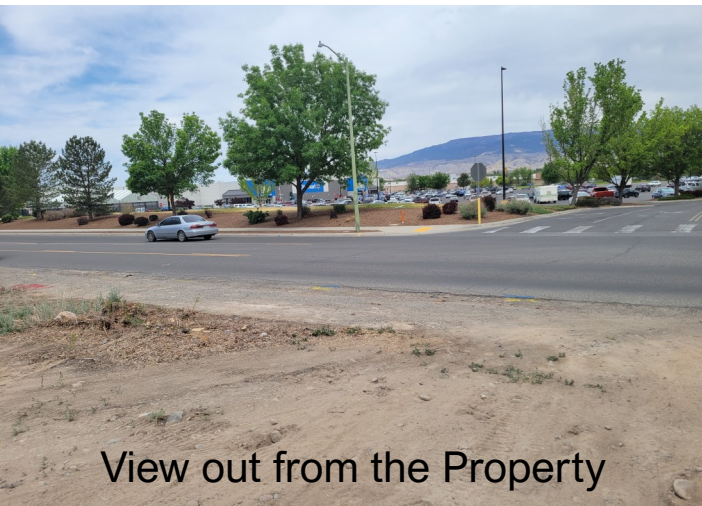
View out from the Property