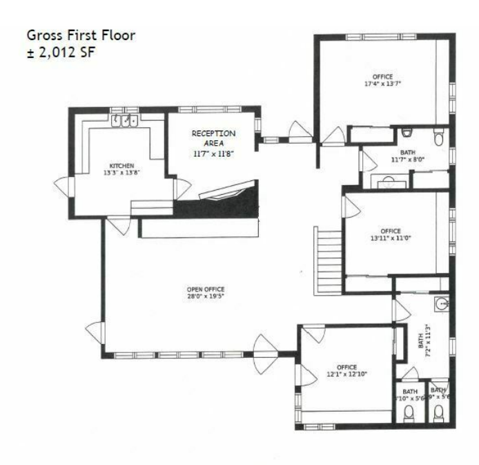
SIZES AND DIMENSIONS ARE APPROXIMATE, ACTUAL MAY VARY