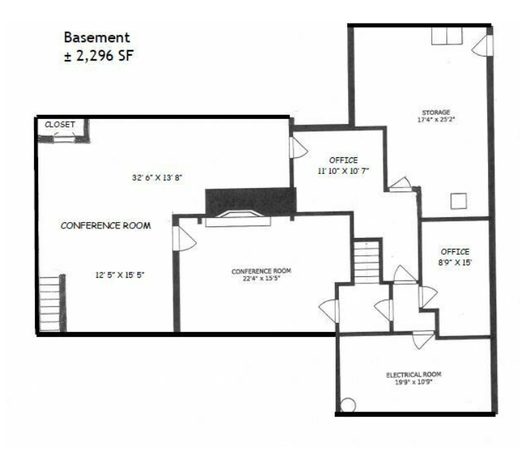
SIZES AND DIMENSIONS ARE APPROXIMATE, ACTUAL MAY VARY.