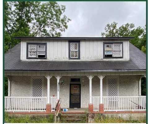
House #3: 2091 Jeffersonville Rd