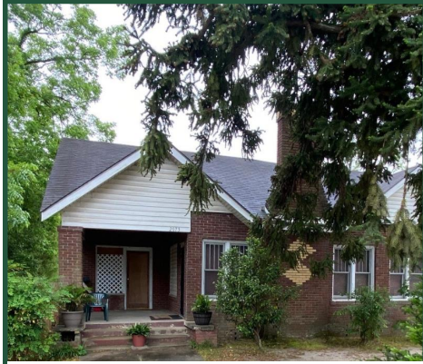
House #1: 2073 Jeffersonville Rd