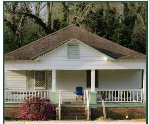
House #6: 2141 Jeffersonville Rd