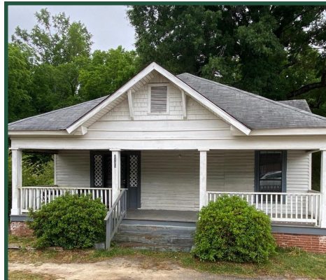
House #5: 2125 Jeffersonville Rd