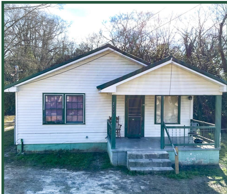
House #4: 2111 Jeffersonville Rd