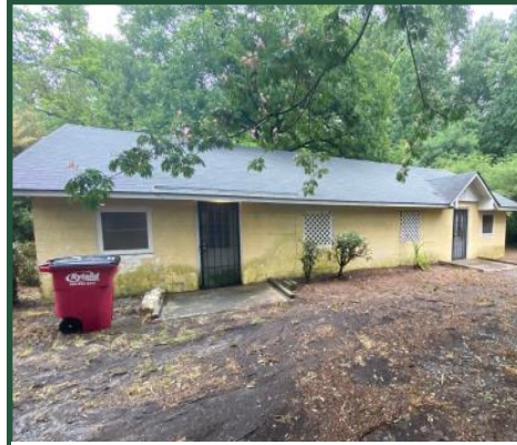
House #2: 2073A Jeffersonville Rd