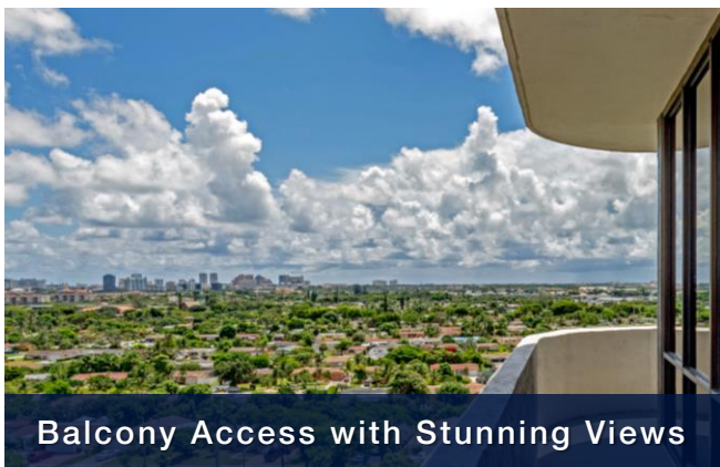
Balcony Access with Stunning Views