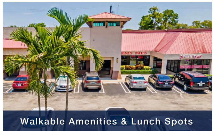
Walkable Amenities & Lunch Spots