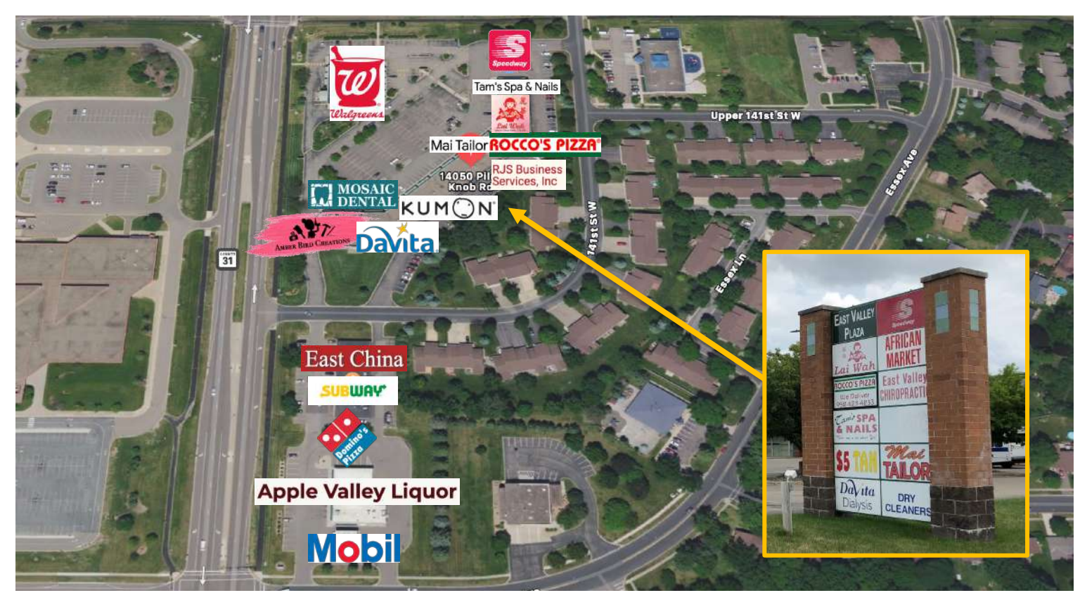
This information is accurate as of the date of printing and is subject to change without notice. All information is deemed accurate, but cannot be guaranteed.