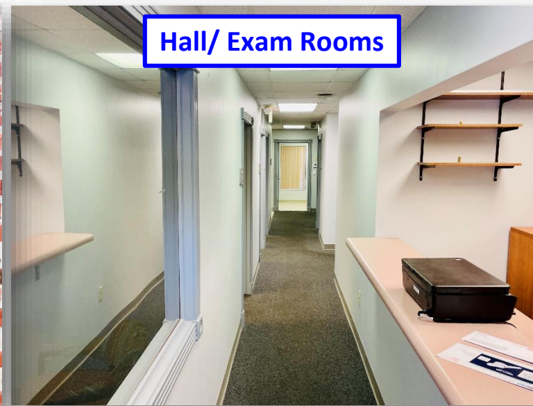
Hall/ Exam Rooms