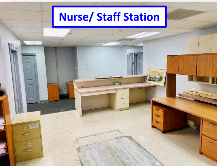
Nurse/ Staff Station