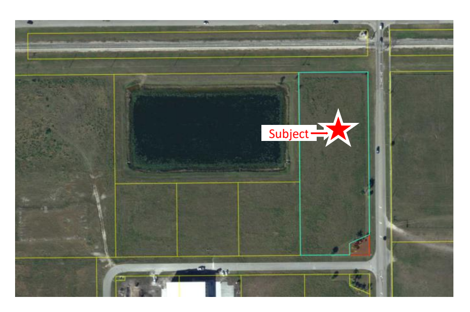
501 Commerce Court, Clewiston, FL 33440