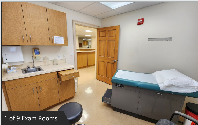
1 of 9 Exam Rooms