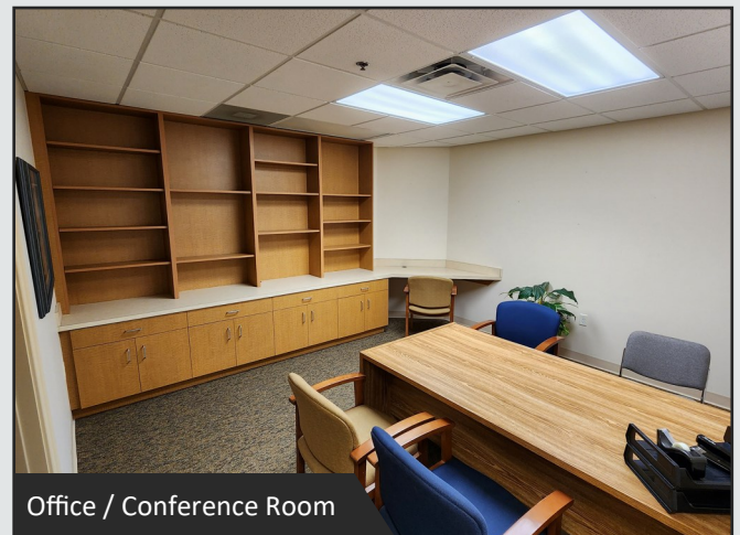
Office / Conference Room