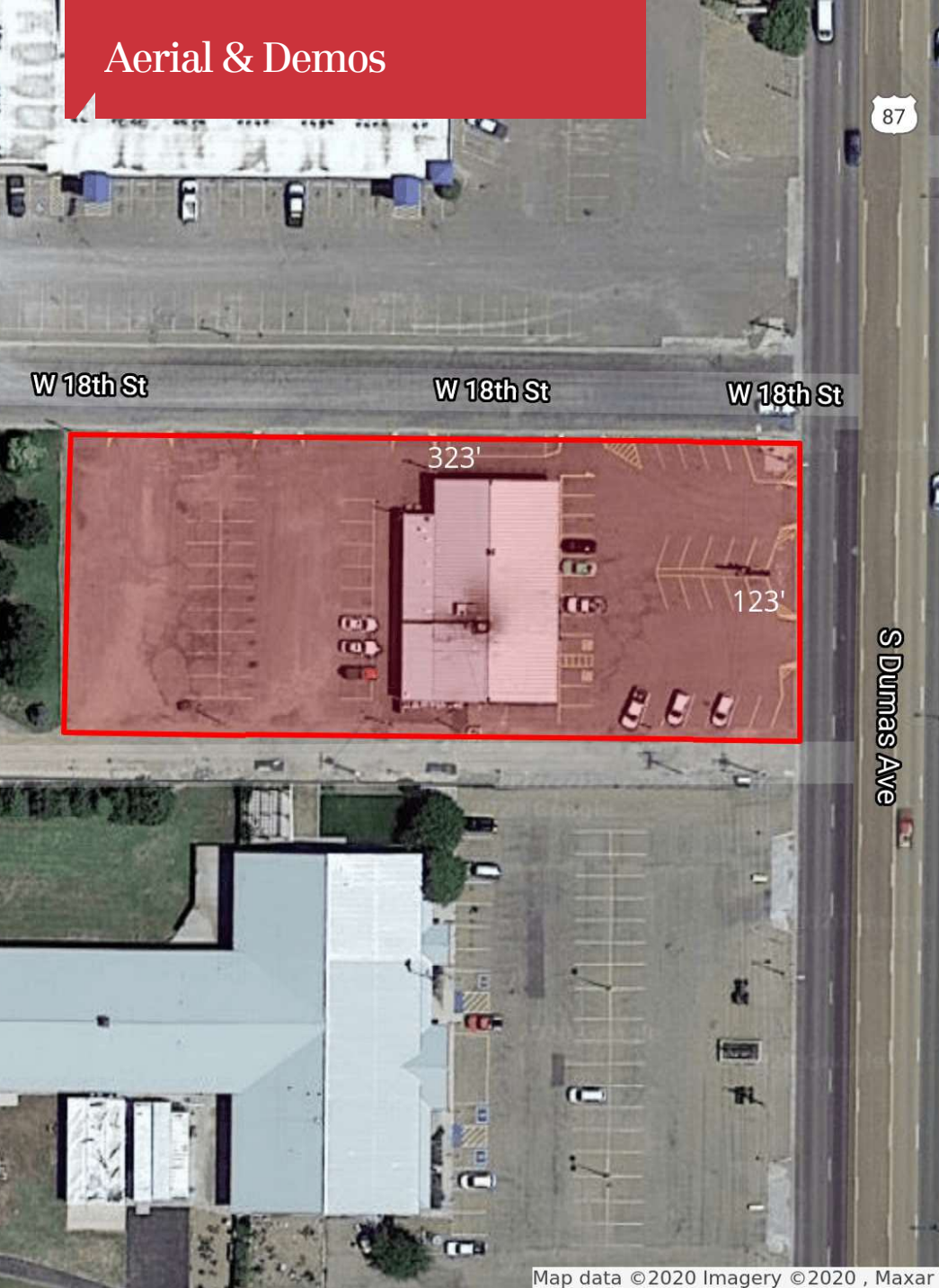
Map data ©2020 Imagery ©2020, Maxar