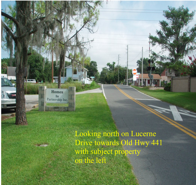
Looking north on Lucerne Drive towards Old Hwy 441 with subject property on the left