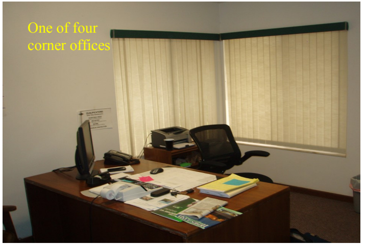
One of four corner offices