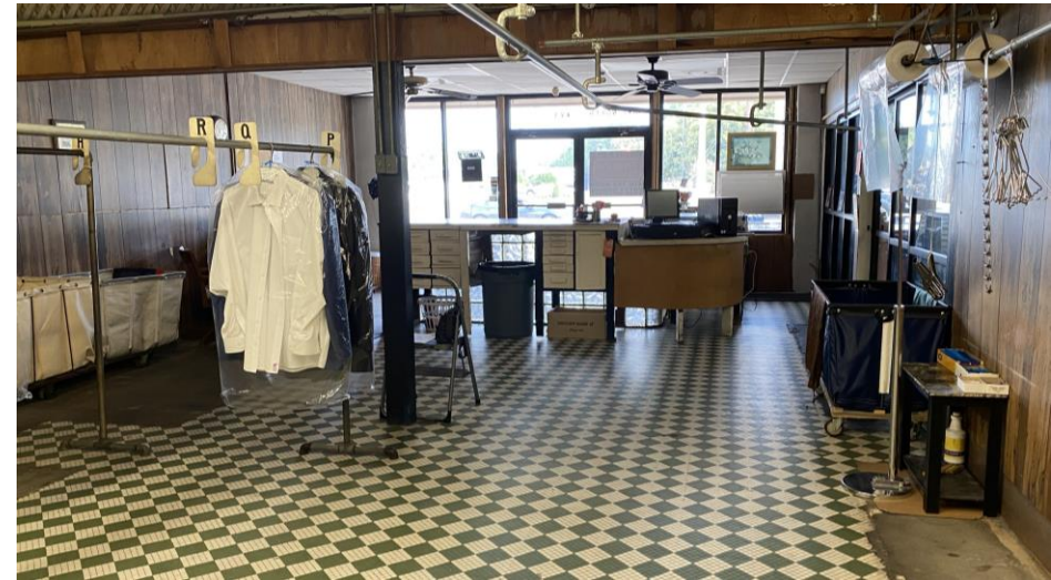
Former Dry Cleaners

Mainly wide-open floorplan with 2 offices & 1 restroom