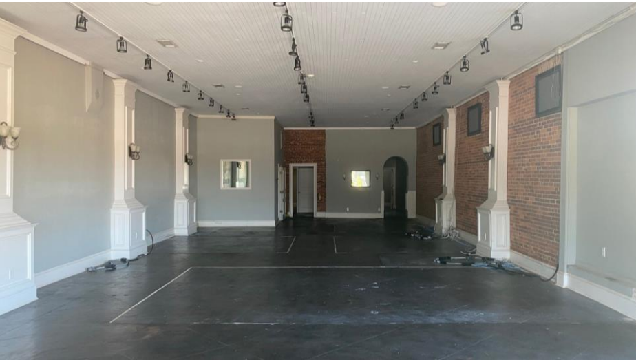
Former Loan Office