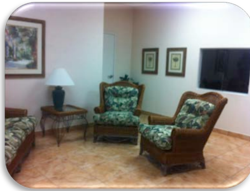
Furnished Reception Area