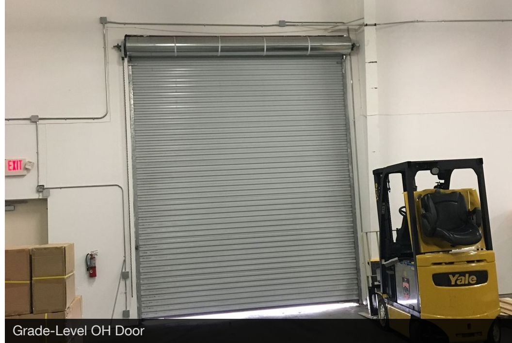
Grade-Level OH Door