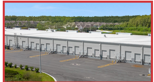
Dock-High Overhead Doors