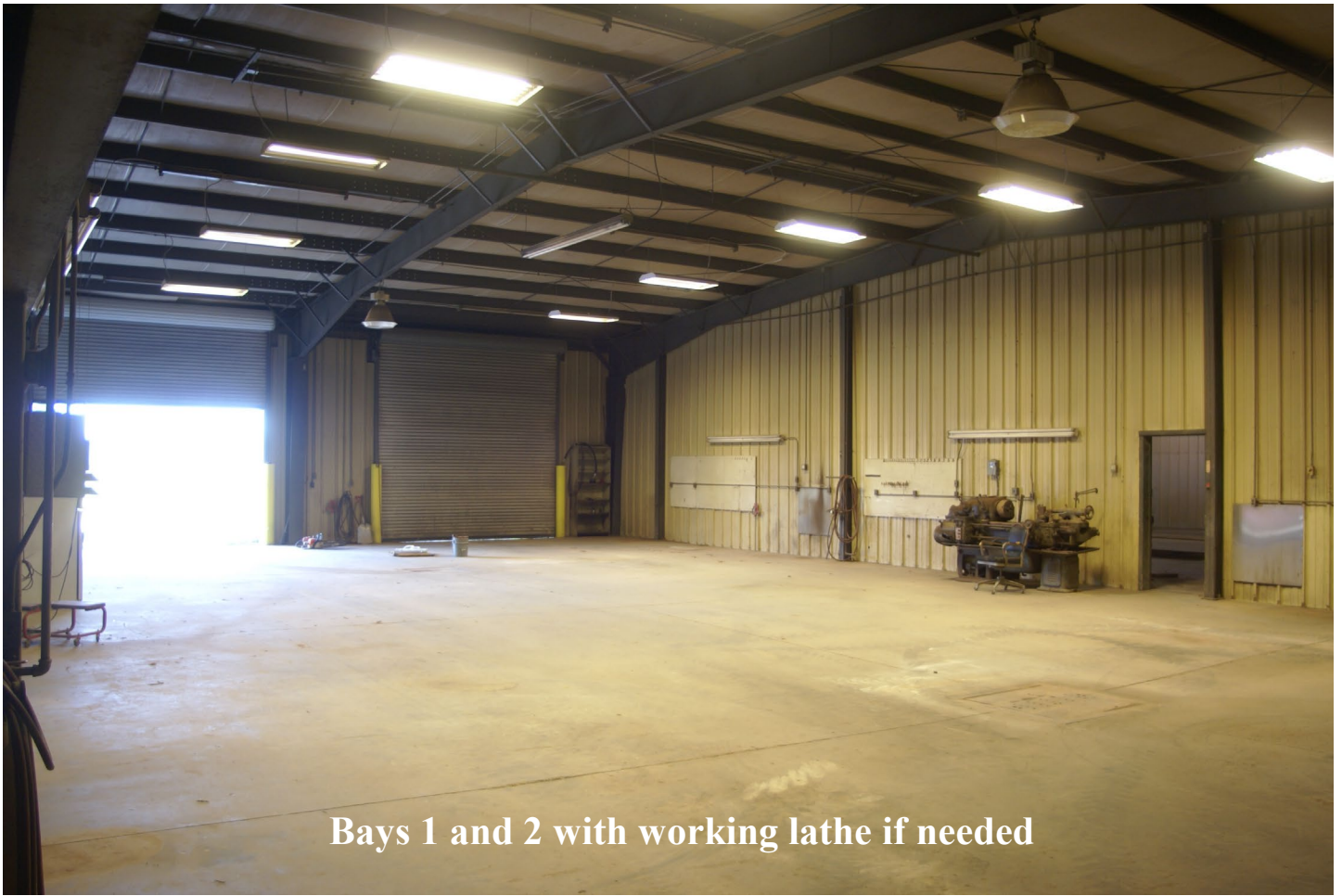
Bays 1 and 2 with working lathe if needed