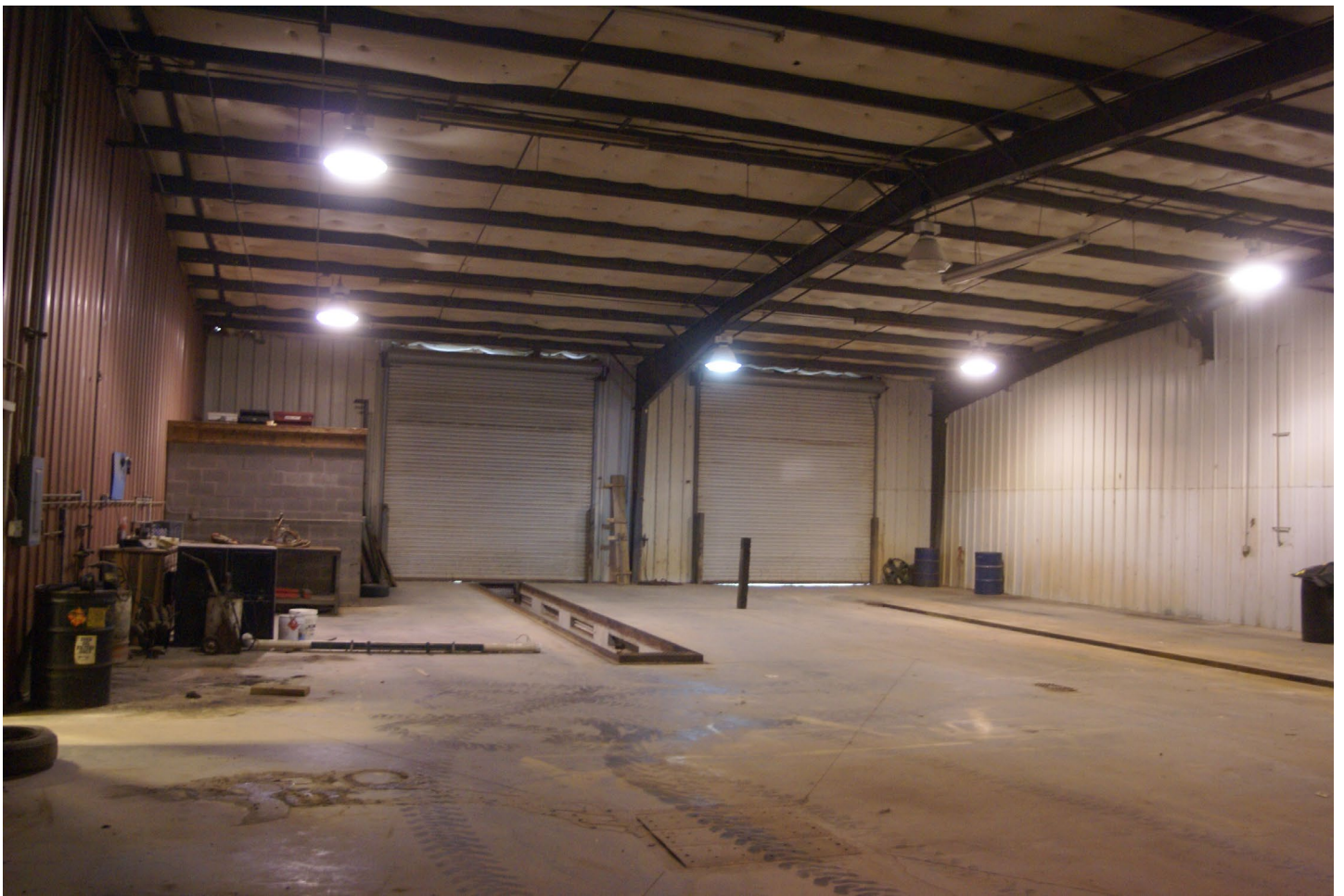
Bays 3 and 4 with grease pit and wash drain