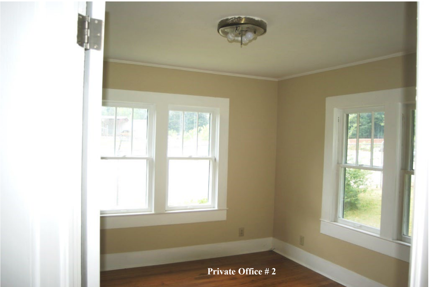
Private Office # 2