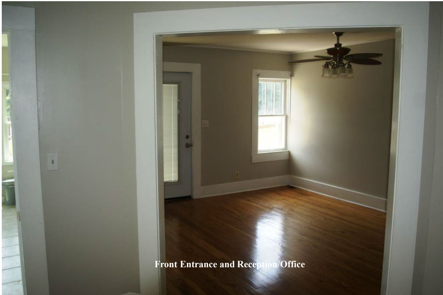
Front Entrance and Reception/Office