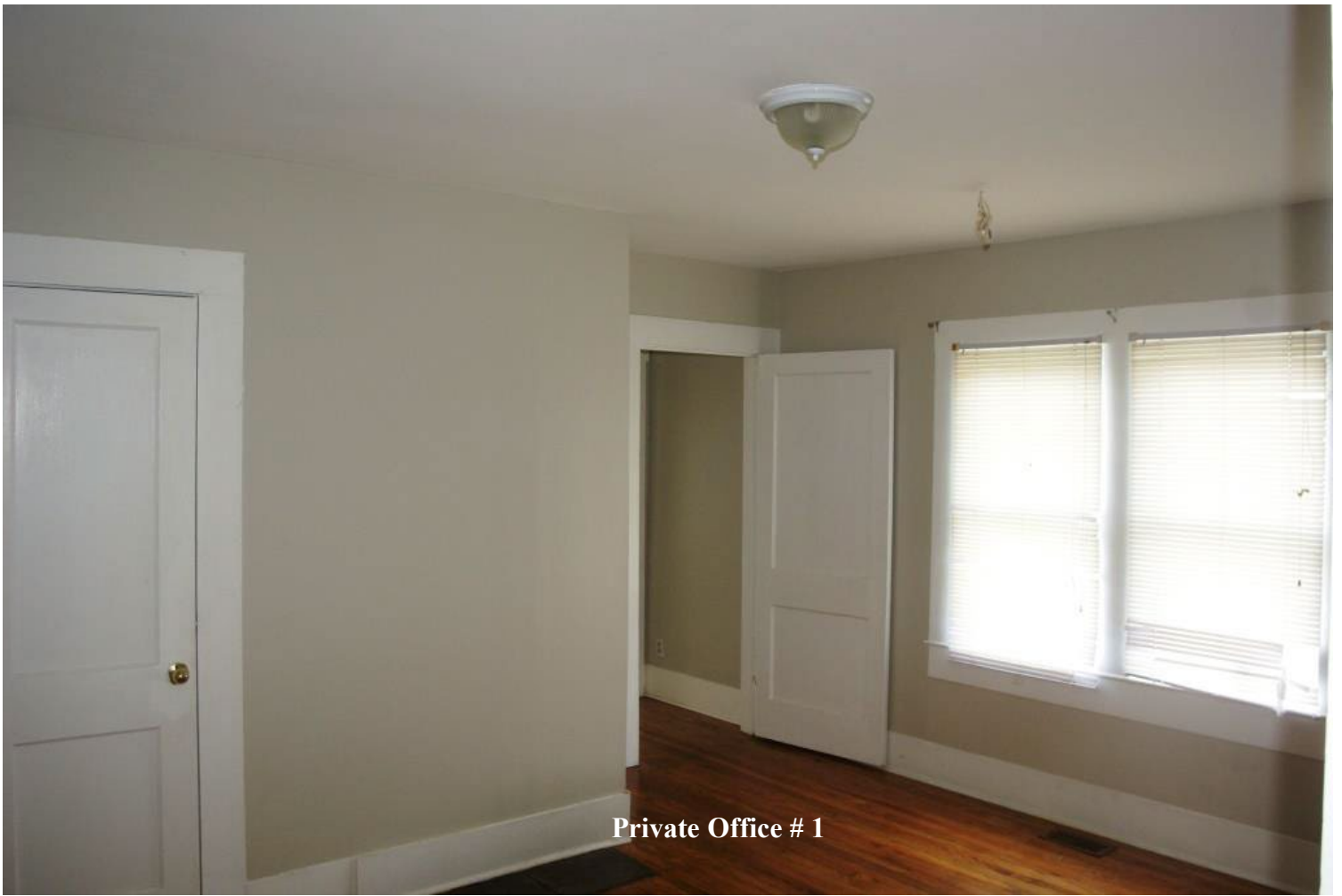
Private Office # 1