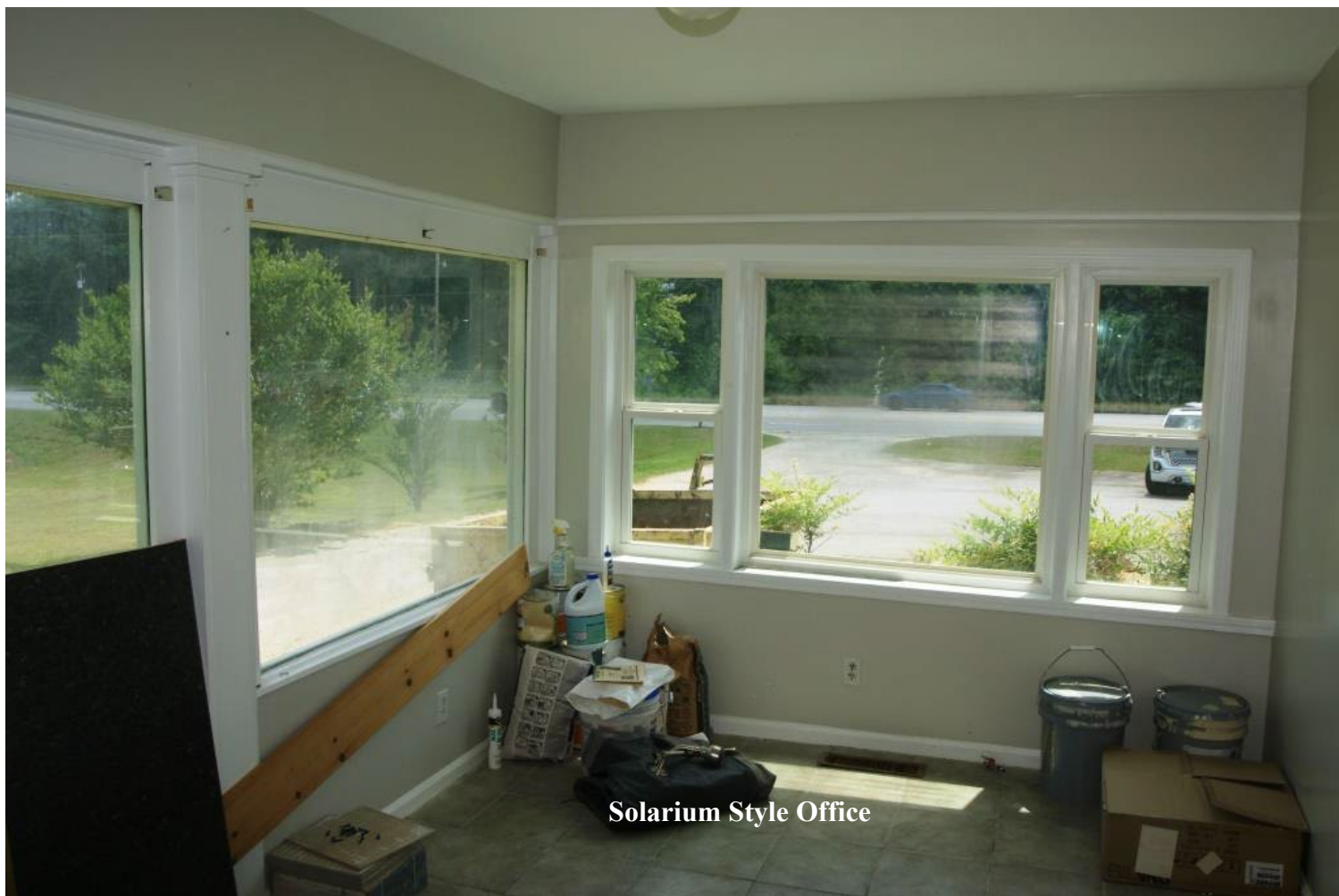
Solarium Style Office