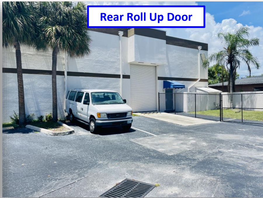
Rear Roll Up Door

Disclaimer: This offering subject to errors, omissions, prior sale or withdrawal without notice.