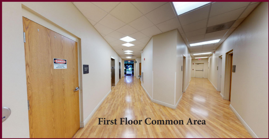
First Floor Common Area