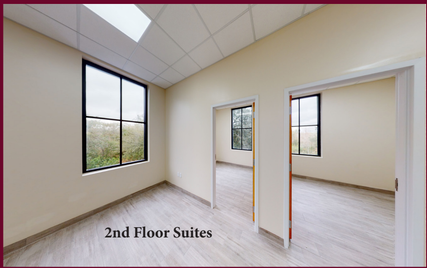
2nd Floor Suites