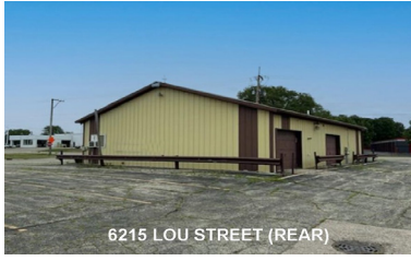
6215 LOU STREET (REAR)