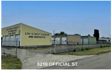
6210 OFFICIAL ST.