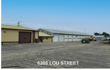
6205 LOU STREET