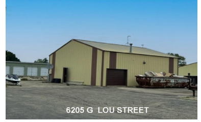
6205 G LOU STREET