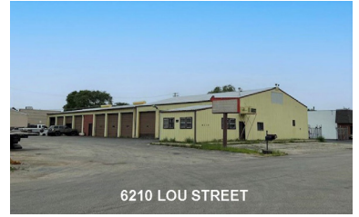
6210 LOU STREET