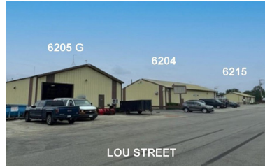
6205 G LOU STREET