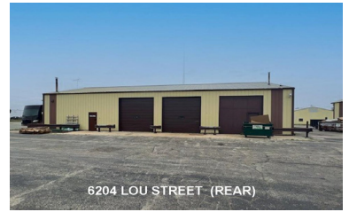
6204 LOU STREET (REAR)