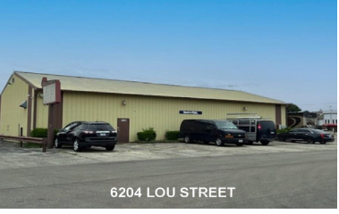
6204 LOU STREET