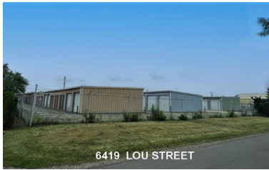
6419 LOU STREET