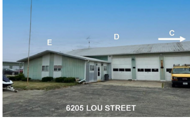
6205 LOU STREET