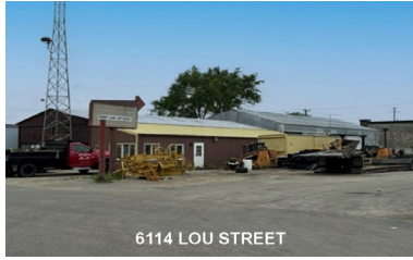
6114 LOU STREET