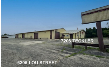
6205 LOU STREET