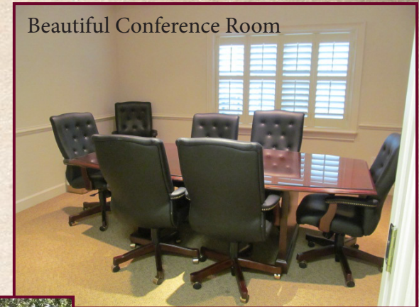
Beautiful Conference Room