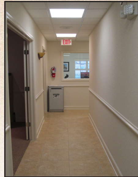
Large offices all have glass walls/windows for a light and bright workspace