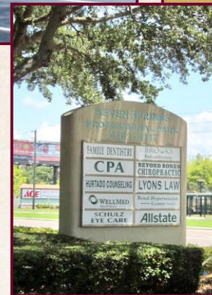
Prominent Monument Sign