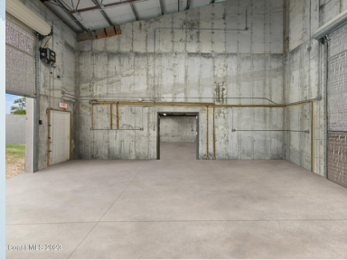
Coast MLS 2023