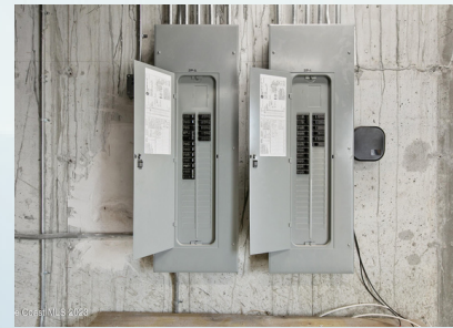
Coast MLS 2023