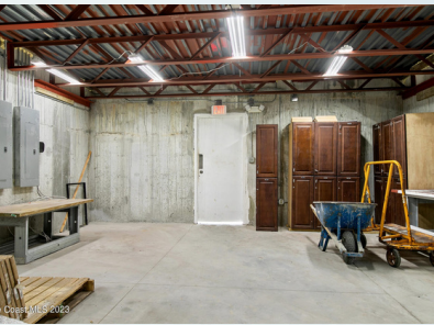
Coast MLS 2023