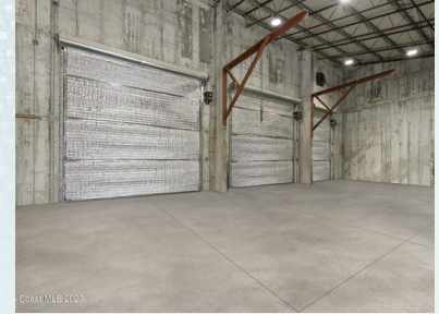
Coast MLS 2023