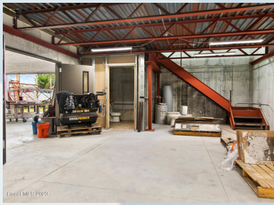
Coast MLS 2023