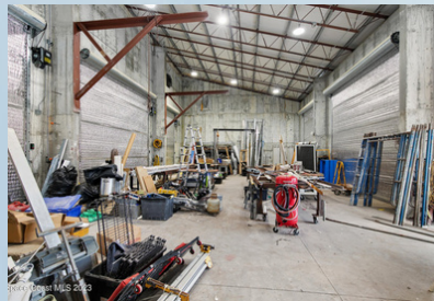
Coast MLS 2023