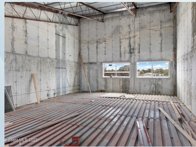
Coast MLS 2023