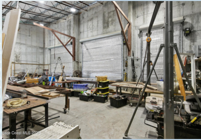
Coast MLS 2023