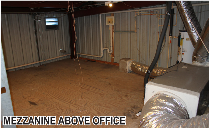
MEZZANINE ABOVE OFFICE