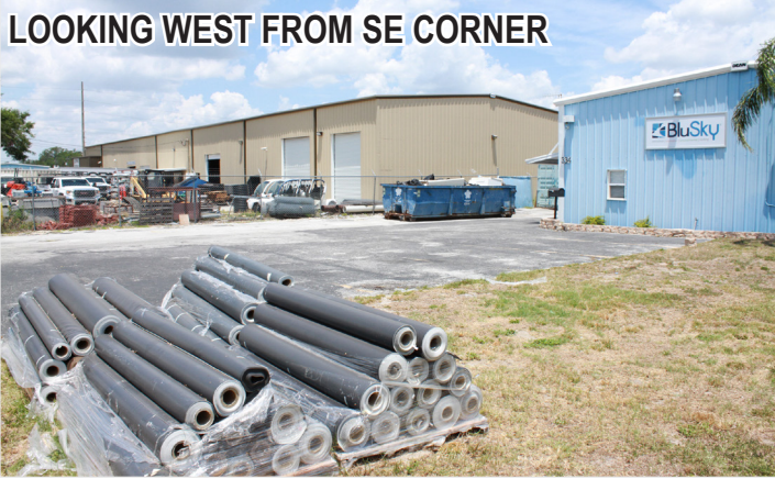
LOOKING WEST FROM SE CORNER