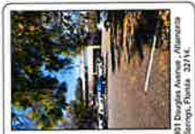
931 Douglas Avenue - Altamonte Springs, Florida 32714

Legal Description: LOT 6 LESS RIGHT OF WAY OF STATE ROAD NO. 405, ALSO KNOWN AS ALTAINSPS, BEING THE SOUTHWEST CORNER OF THE TRACT IN PLAT BOOK 6, PAGE 17, PUBLIC RECORDS OF SEMINOLE COUNTY, FLORIDA, BEING THE SOUTHWEST CORNER OF THE TRACT IN BOOK 1412, PAGE 1151, PUBLIC RECORDS OF SEMINOLE COUNTY, FLORIDA.