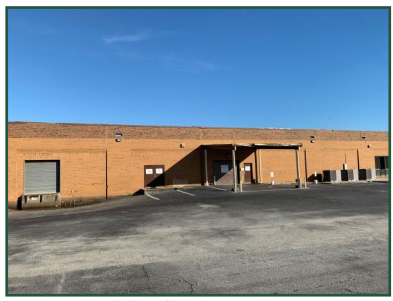
Building A Side with Roll-Up Door