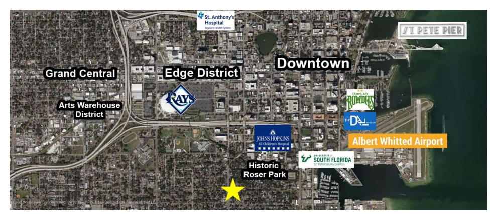
AREA DESCRIPTION : The assemblage is mere blocks to Bayfront Hospital, USF-St. Pete, Tropicana Field, Salvador Dali and more.

The savvy investor gets a 3-parcel land assemblage located in an Opportunity Zone with potentially other incentive packages. Approved uses beyond multifamily development on this site include a Hotel, Office (General or Medical), Restaurant and Bar, Mixed Use, School, Nursing Home, Funeral Home, House of Worship – even an Indoor Recreation Facility (pickleball courts, swimming pools, amusement park or similar endeavors). An arborist report was conducted, and trees can be removed with a permit. The sellers have done extensive planning for this site and would entertain a joint venture development with experienced and qualified partners.