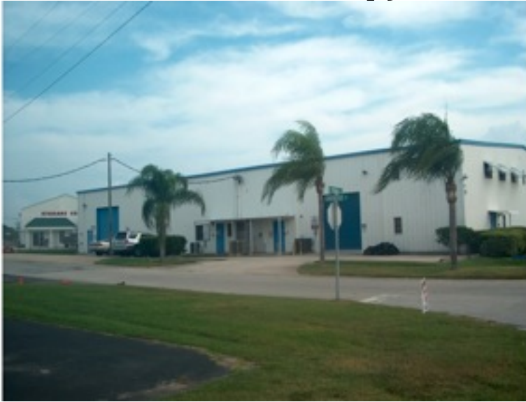
View from the West. Note the loading doors on the north and south areas.