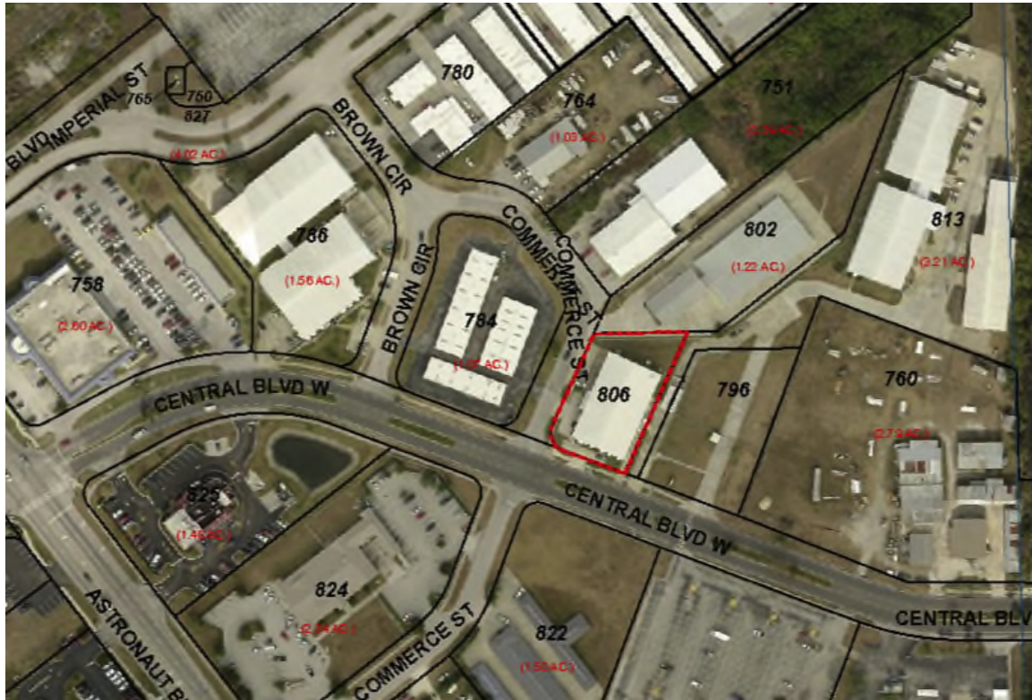
Aerial View. Note the 3 additional buildings to the NE for sale accessing W. Central Blvd to the east of the subject property