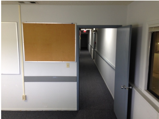
Office Area in south