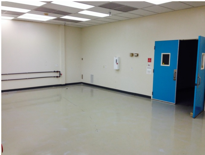
Clean Room in the north warehouse area