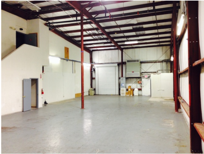
Warehouse area in south