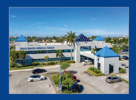
4601 N Congress Ave West Palm Beach, FL