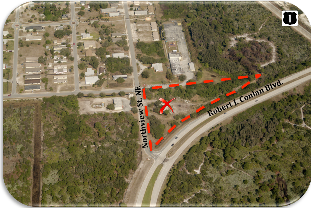
Located off Robert J Conlan Blvd. 1/2 mile east of US 1 North of Palm Bay Rd.

-ZONED: Light Industrial City of Palm Bay