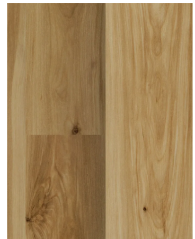
luxury vinyl plank first floor/ restrooms