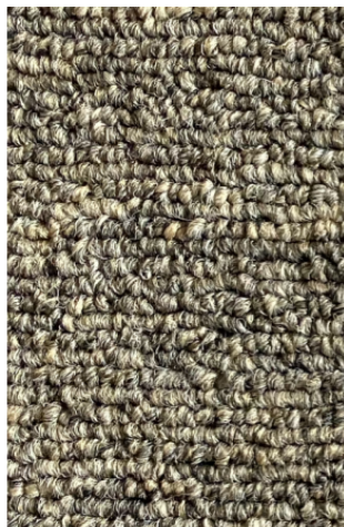
carpet mezzanine level/ stairs