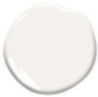
wall color SW 7008 alabaster