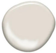
door/ trim color SW 7632 modern gray