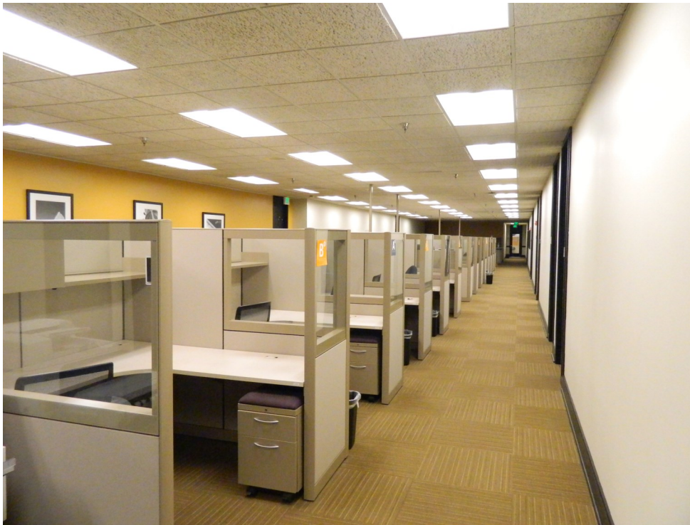
Existing Cubicles & Workstations