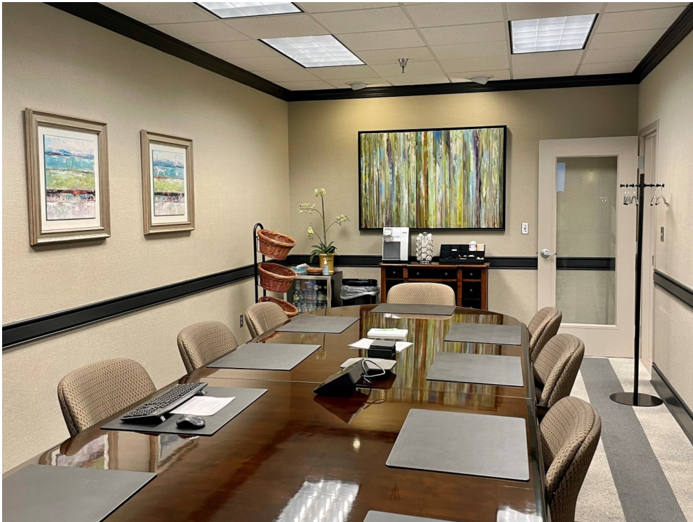
Large Conference Room