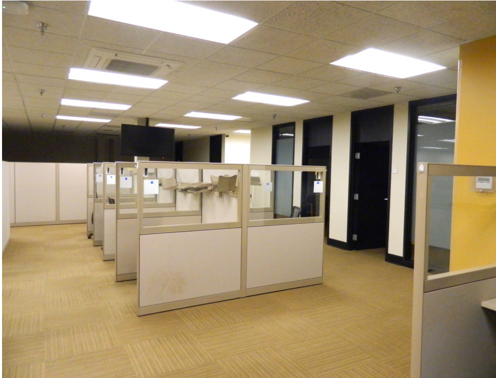
Existing Cubicles & Workstations