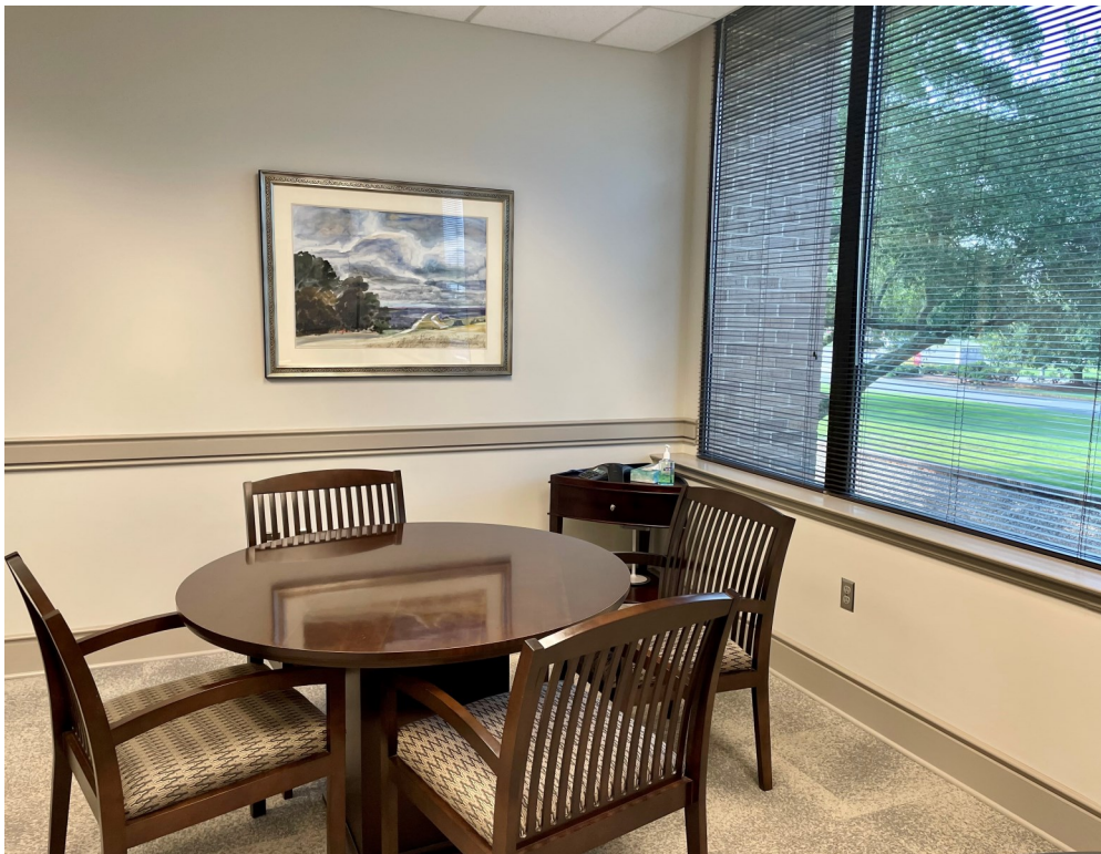
Executive Office Conf. Space