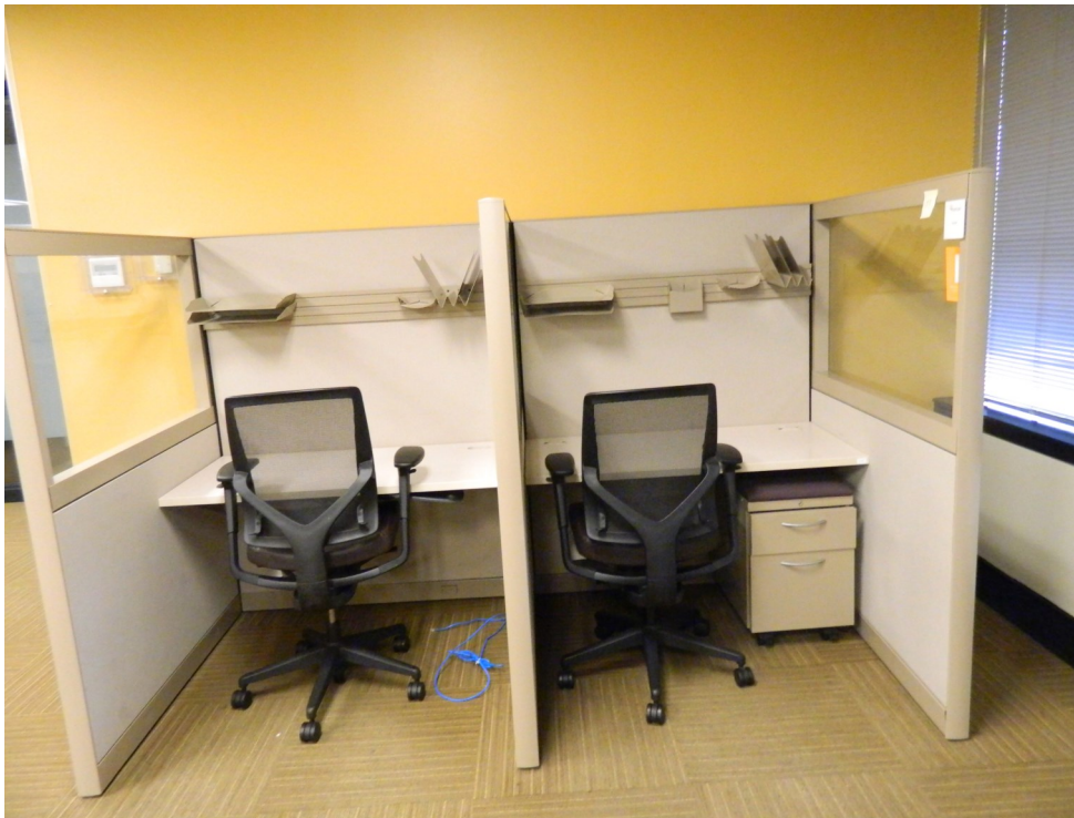
Existing Cubicles & Workstations