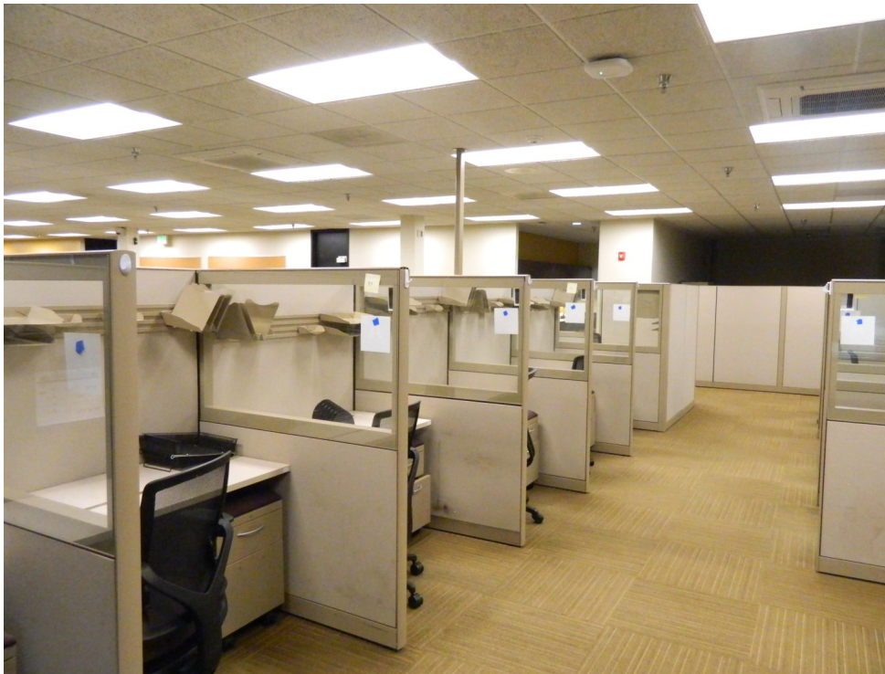
Existing Cubicles & Workstations