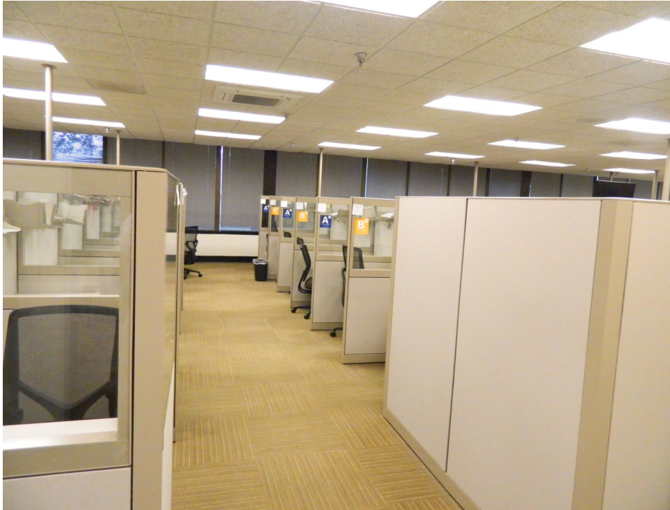
Existing Cubicles & Workstations