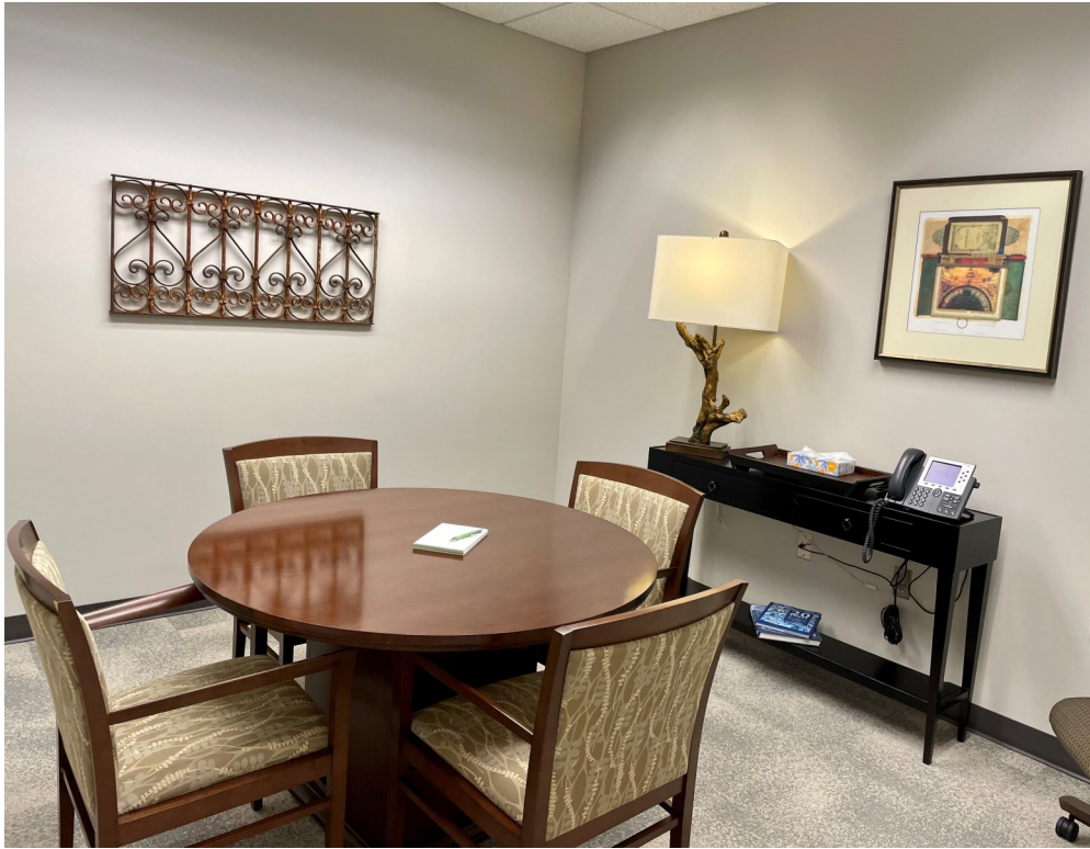
Small Conference Room