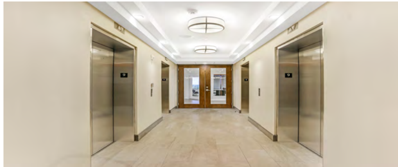
Clockwise from top left: New Tenant Reception Area | Lobby Area | New Tenant Conference Room | Hallway/Elevators