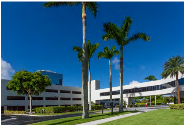
Clockwise from top left: Covered Walkway From Garage | Lobby Area | Exterior View of Walkway From Garage