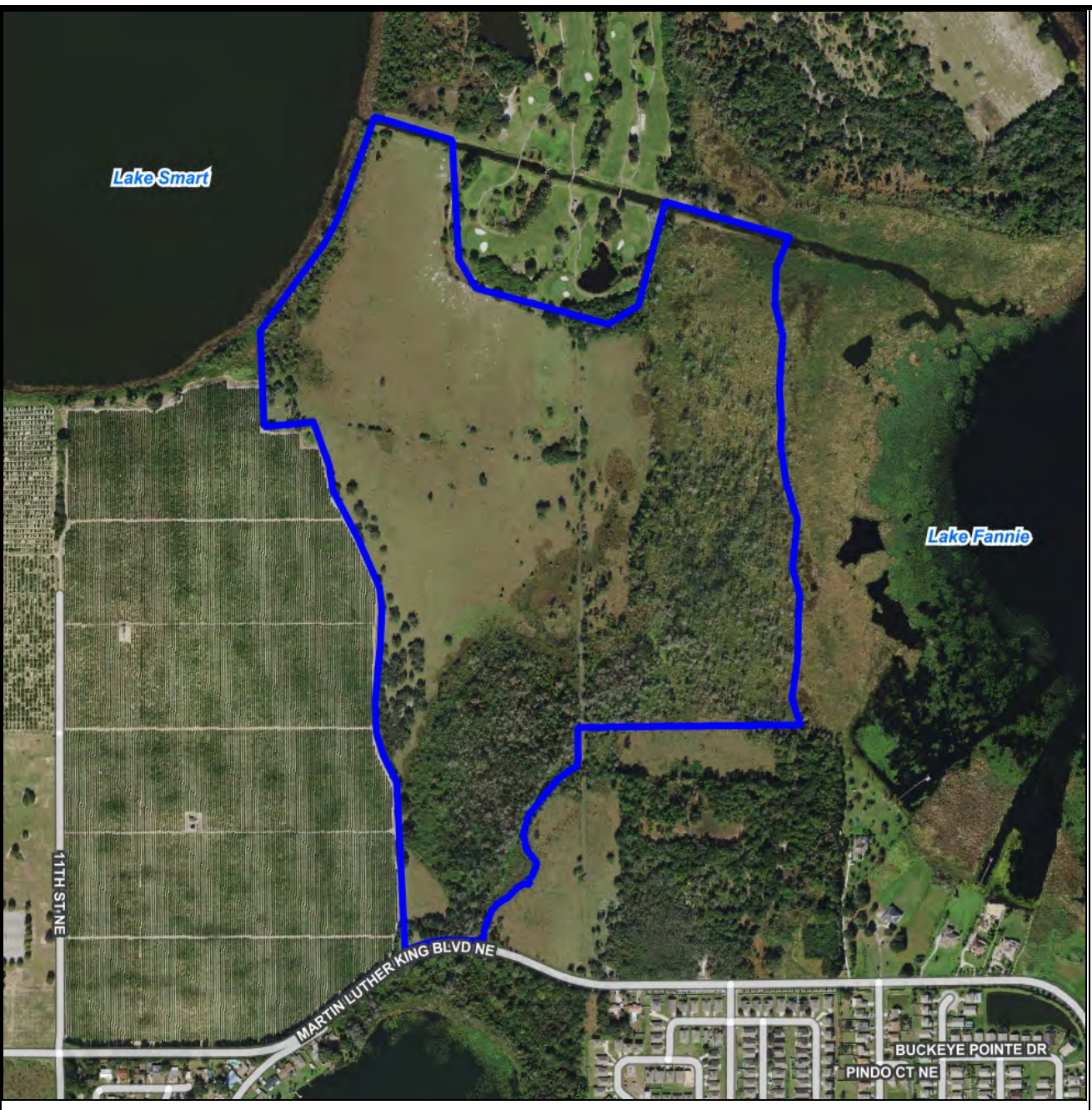
©2021 SVNIC. SVN | Saunders Ralston Dantzler Real Estate® is a registered trademark licensed to SVN Shared Value Network®. Any information displayed should be verified and is not guaranteed to be accurate by SVN Saunders Ralston Dantzler. You may not copy or use this material without written consent from SVN Saunders Ralston Dantzler.