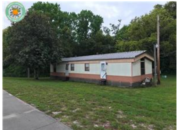
48 S DEAN RD, ORLANDO, FL 32825 3/18/2019 8:58 AM