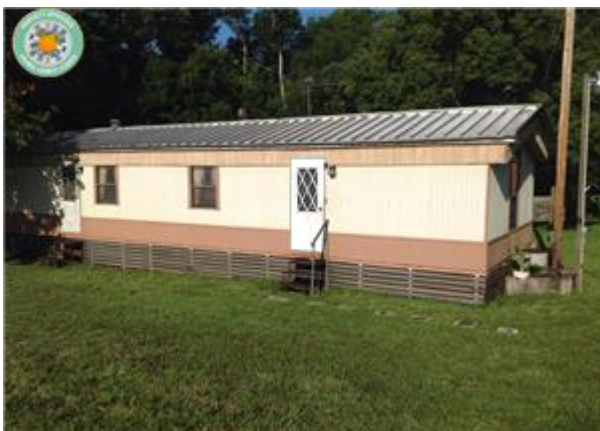
70 S DEAN RD 06/17/2014