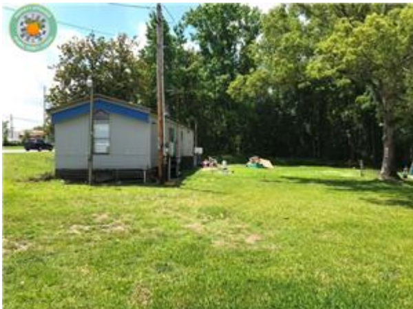
48 S DEAN RD, UN-INCORPORATED, FL 32825 4/30/2021 12:02 PM