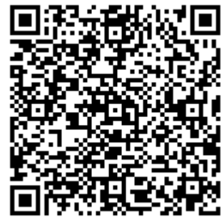
QR Code For Mobile Phone