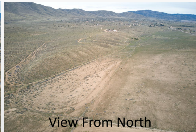
View From North