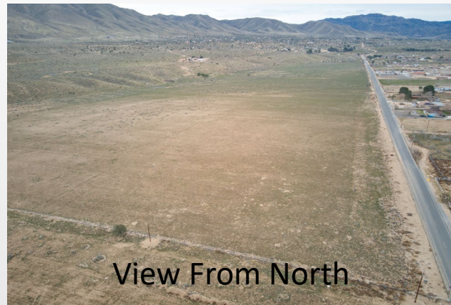
View From North

±215.75 Acres Deep Creek Rd., Apple Valley, CA 92308