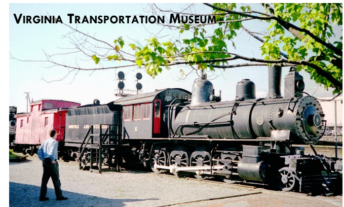
VIRGINIA TRANSPORTATION MUSEUM

THIS INFORMATION HAS BEEN SECURED FROM SOURCES WE BELIEVE TO BE RELIABLE, BUT WE MAKE NO REPRESENTATIONS OR WARRANTIES, EXPRESSED OR IMPLIED, AS TO THE ACCURACY OF THE INFORMATION. REFERENCES TO SQUARE FOOTAGE OR AGE ARE APPROXIMATE. UPLAND HAS NOT REVIEWED OR VERIFIED THIS INFORMATION. BUYER MUST VERIFY THE INFORMATION AND BEARS ALL RISK FOR ANY INACCURACIES.