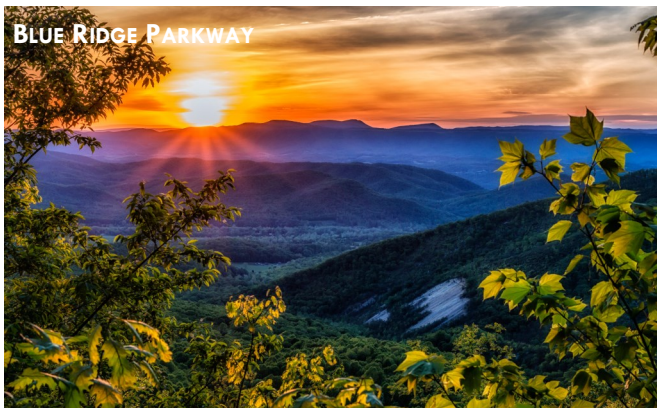
BLUE RIDGE PARKWAY

Voted one of "Southwest Virginia's Best Festivals" by Virginia Living magazine and “Favorite Annual Festival” by the readers of The Roanoke magazine, Community School's Strawberry Festival is one of Roanoke’s most popular and well-known events. The Virginia Transportation Museum is a unique destination that celebrates the rich history of transportation in the Commonwealth of Virginia. The museum gives visitors the chance to see how transportation has changed and includes everything from historic trains, streetcars, buses, and much more.