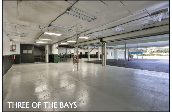
THREE OF THE BAYS