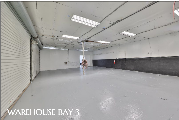
WAREHOUSE BAY 3