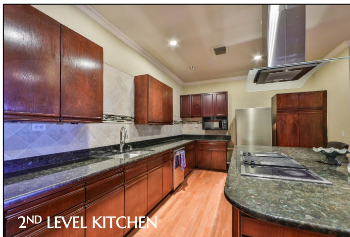
2ND LEVEL KITCHEN