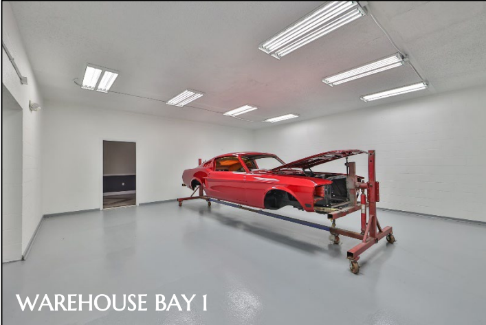
WAREHOUSE BAY 1