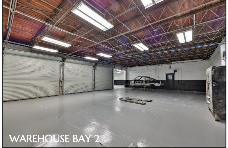
WAREHOUSE BAY 2