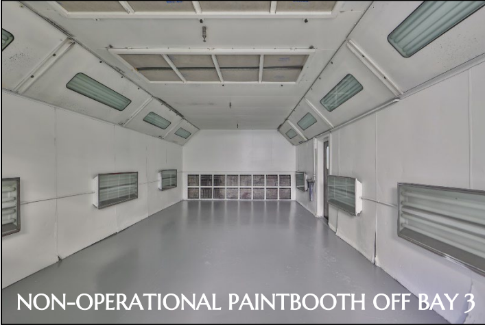
NON-OPERATIONAL PAINTBOOTH OFF BAY 3