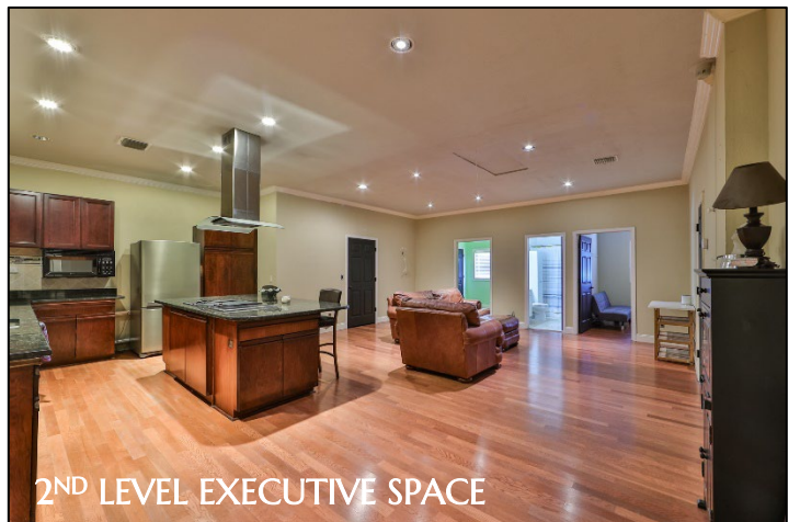
2ND LEVEL EXECUTIVE SPACE