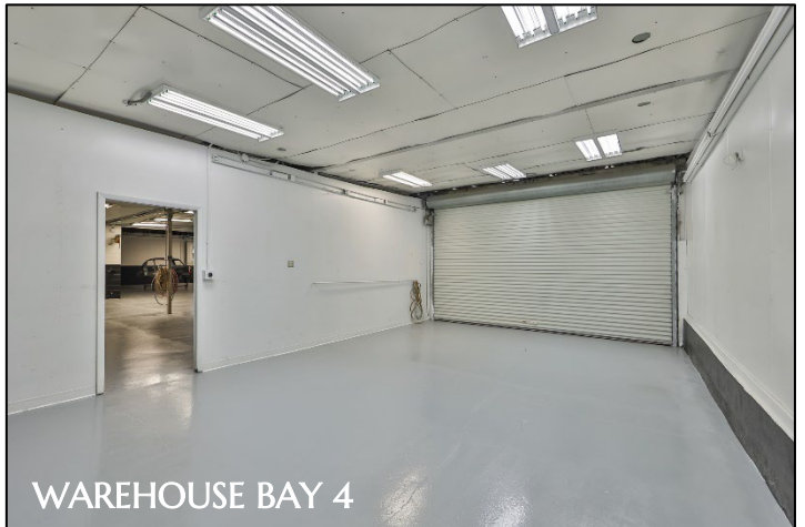
WAREHOUSE BAY 4

This property is ideally located along the north side of Tyrone Blvd., (Alt. 19) in St. Petersburg Florida. Situated on .29+ acre, it contains 6,274± SF built in 1960/1983 and recently renovated in 2023. There is also 2,642 SF of canopies to accommodate outside work. There are 4 warehouse bays, a 25'± x 14'± non-operational paint booth, seven (7) overhead doors, office area, kitchen and 2 bathrooms on the first level. There are executive offices on the 2nd level to include a full-size kitchen with custom cabinets and cook island, 2 private offices, open area, utility area with washer and dryer and a bathroom with shower. The property is fenced and has 3 phase power. The roof is TPO (Thermoplastic Olefin), a durable and energy-efficient material (replaced 6-7 years ago). There are 10 striped parking spaces with more parking available under the canopy areas. There are also 2 storage sheds not included in the square footage. Property is located on a frontage road with street parking. This is a great building for many uses.