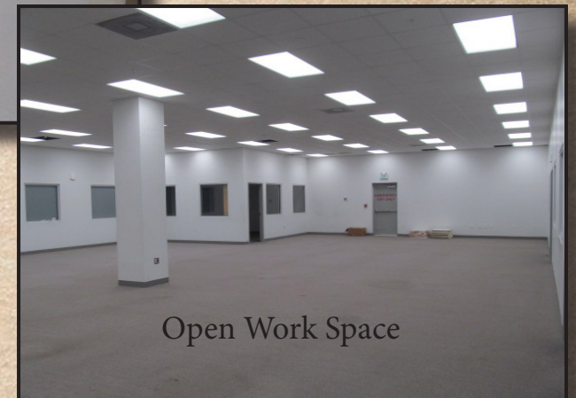
Open Work Space