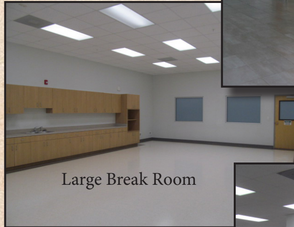
Large Break Room