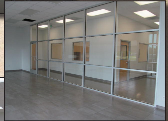
Lots of Windows!