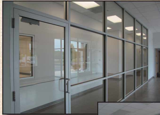
Light & Bright Lobby